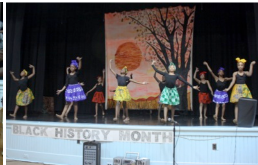
Pictured (above): Scenes from RPCS Celebrates Black History and Culture.