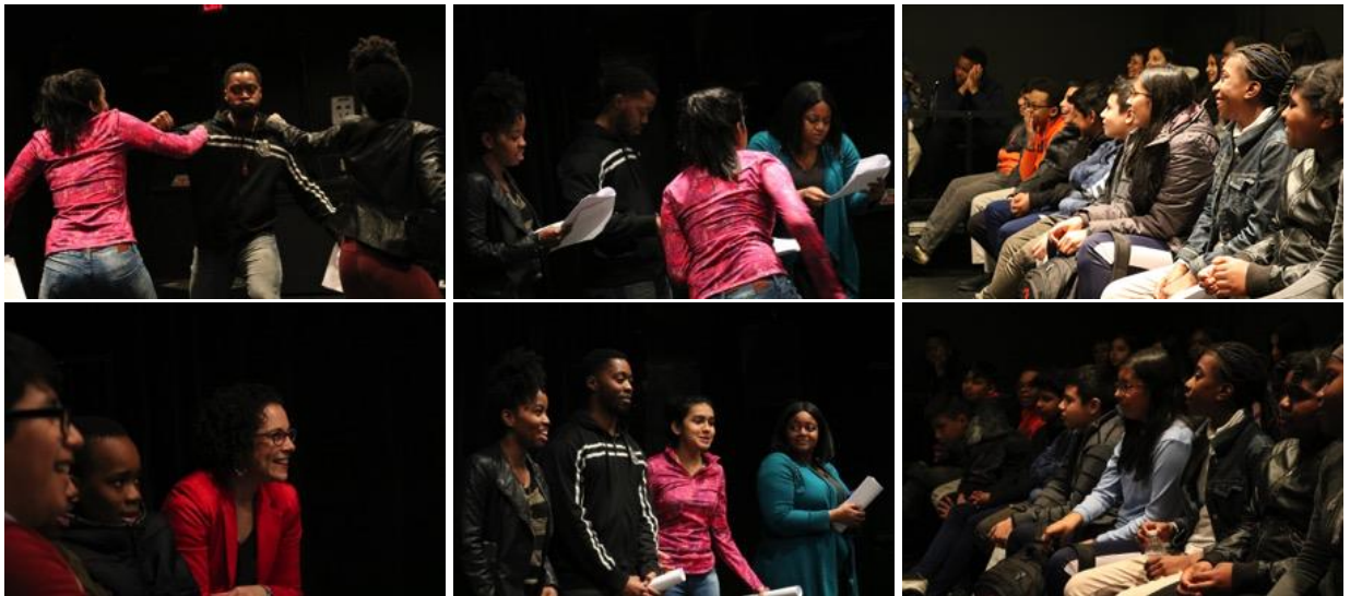
Pictured: Luna Stage actors perform script from Cleveland Street students.