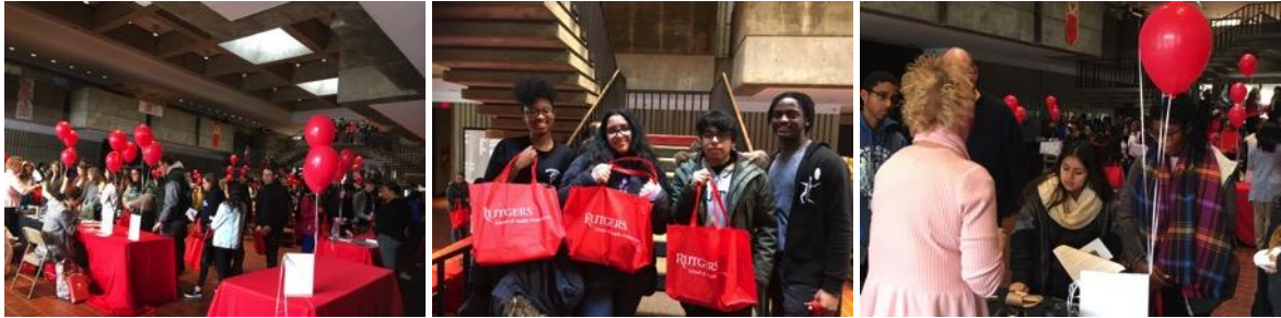
Pictured: Orange High School Health Science Career and Technical Education students at the Rutgers Health Science College Fair.

During the event, students met with professors from all of the various health related professional schools at Rutgers. Many offered hands-on experiences for the students, like taking sonograms, etc. The field trip was a success for all, increasing awareness about how to sustain themselves academically in college, as well as potential areas of health care that they may wish to explore.