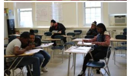
Pictured: Scenes from the Middle School Debate Championship.