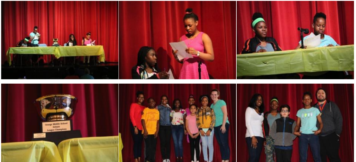
Pictured: Scenes from the Middle School Debate Championship including the Park Avenue School and the Forest Street Community School teams (bottom middle and bottom right).