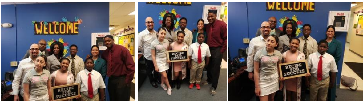
Pictured: Students and staff at APEX on Tremendous Thursday.

Tremendous Thursday at APEX.... "You can't stop someone who knows where they're going!" - Anonymous