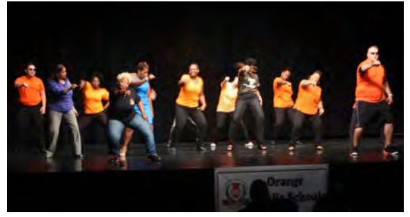
Pictured above and right: Opening and closing scenes from the Superintendent's Forum.