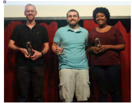
New Teacher Exemplar