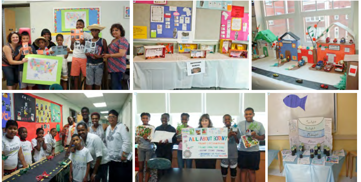
Pictured above: Scenes fro ESY Open House.

Parents and district administrators toured the school, visiting each classroom, viewing the various displays and hearing from the students about what they accomplished during the summer.