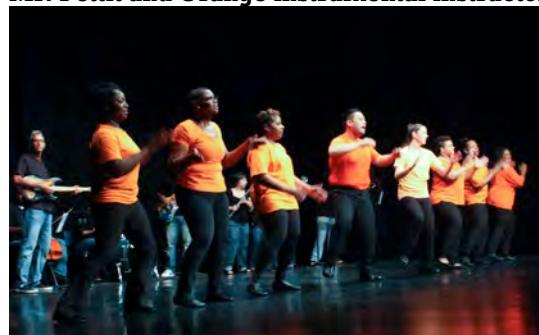
Orange Staff Dance Ensemble.