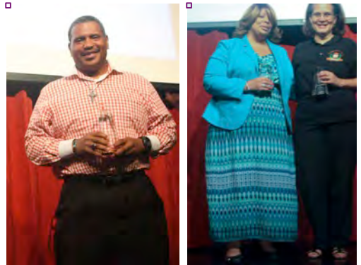
Mentorship and Support Staff Exemplar