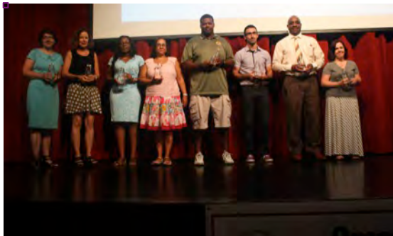
Best Practices Exemplar