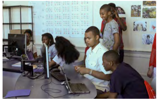
Pictured above and left: Scenes from the Robotics Competition.