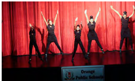
Orange Dance Conservatory students.