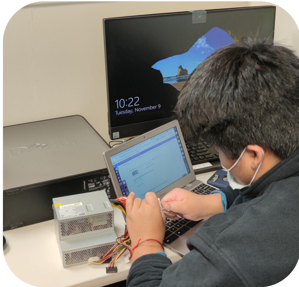
Testing a Power Supply