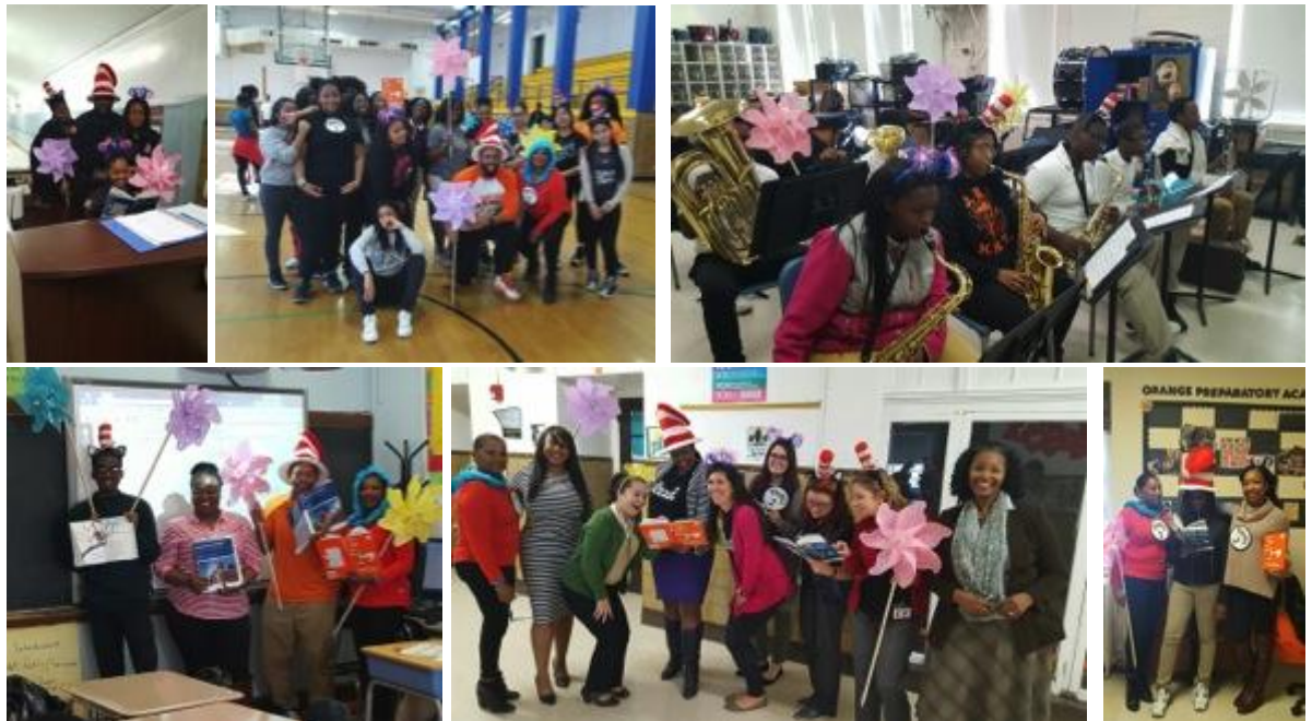
Pictured: Dr. Seuss is celebrated at Orange Preparatory Academy.

Students and staff celebrated the iconic Dr. Seuss with moments of reading during class time and a bit of fun during a break.