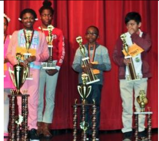
Pictured (in forefront): 1 st , 2 nd and 3 rd place overall district Spelling Bee winners.