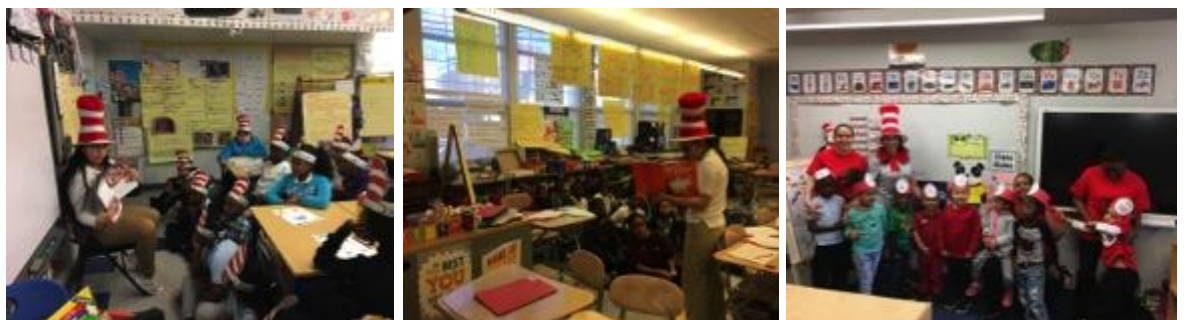
Pictured: Student readers and class participation in Lincoln Avenue School's Read Across America event.