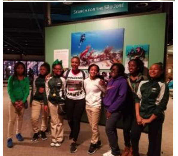
Pictured (above): OACS students at The National Museum of African American History and Culture.