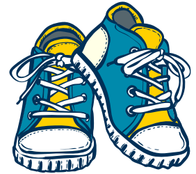
go for a walk