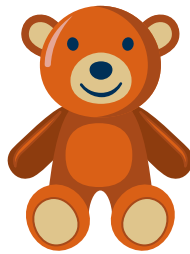
hug a favorite toy