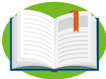
read a book