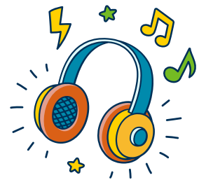
listen to music