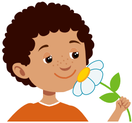
take deep breaths