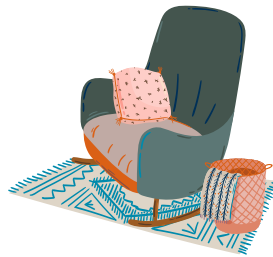
take a break