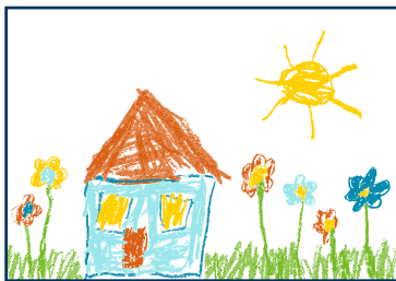
draw a picture