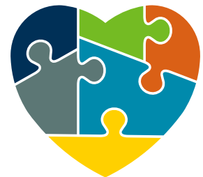
do a puzzle