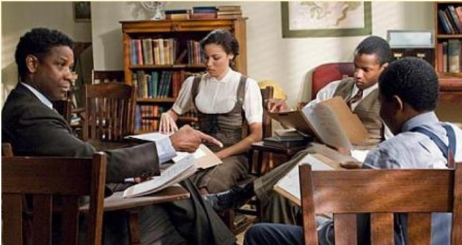
The Great Debaters 2007

Overview: Do you like to argue? The Policy Debate Camp for elementary and middle school students teaches students the key processes of effective debate such as case construction, composing briefs, research, rebuttals, cross-fire, evidence analysis, and summary and final focus. Debate students leave the academic camp with the knowledge, skills, and practical experience needed to excel in life.