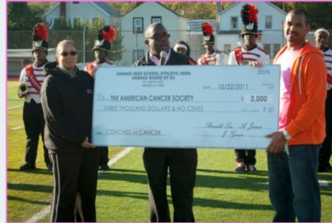
Scenes from 2011 Pink-Out Game event and check presentation to the American Cancer Society.