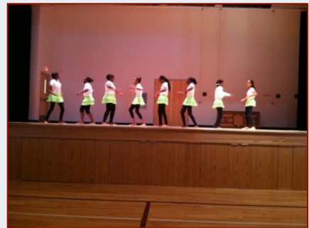
Pictured: Lincoln Avenue School kicked-off The 25 Book Challenge with two assemblies, encouraging students to read and meet the district challenge.