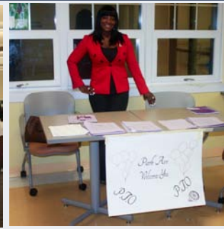
Pictured: Scenes from Lincoln Avenue School and Park Avenue School's Back to School Night including PTO Welcome table at Park Avenue.