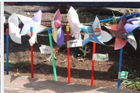
Visit Heywood Avenue School to see "Pinwheels for Peace".