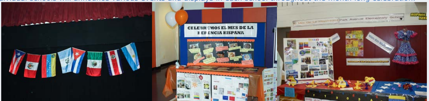
Pictured (above) Past Hispanic Heritage Month Celebrations and displays.

Individual schools will announce various events and displays in each school throughout the month long celebration.