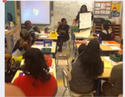
(Submitted by Lincoln Avenue School. Please note: Back to School Night was held on Tuesday, September 18, for grades K-4, and on September 19, for grades 5 - 7)