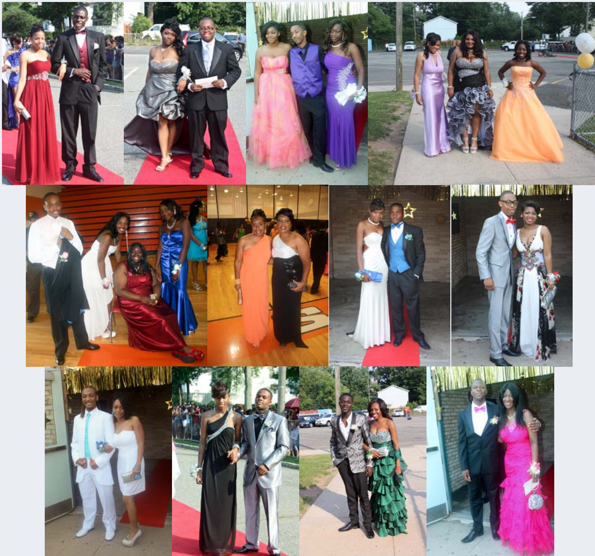
Orange High School students at the 2012 Toast Off.

Orange High School prom goes stayed cool in the record heat during the 2012 Toast Off on June 20, 2012.