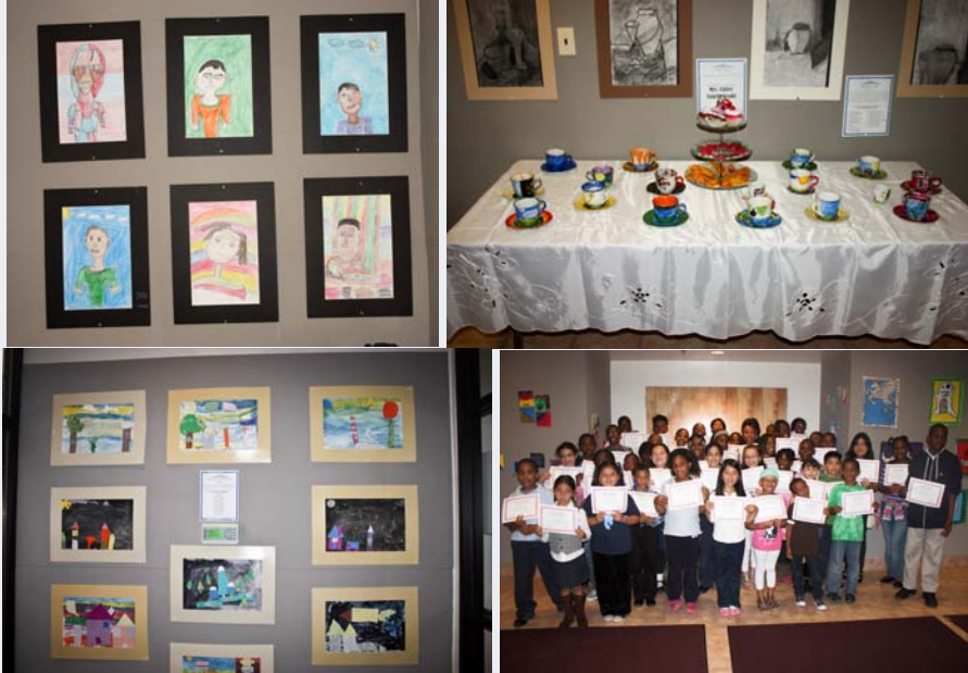
Pictured (left to right) A variety of artwork on display and students with their award certificates at the Board of Education building.