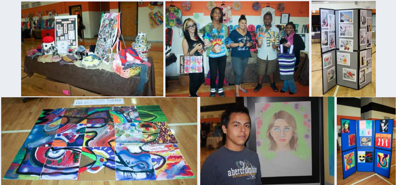
Pictured (left to right) A variety of artwork on display and students with their artwork.