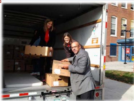
Pictured: Turkey Basket distribution at Lincoln Avenue School (left to right) - Lincoln Avenue parent receiving basket;