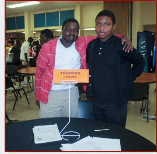
Pictured: Jewelry Design Club display; Robotics Club display; Tornado News display.