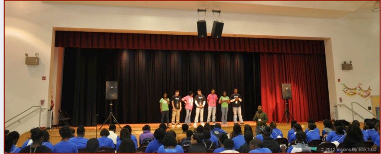
Pictured above: Scenes for Teen Summit 2012