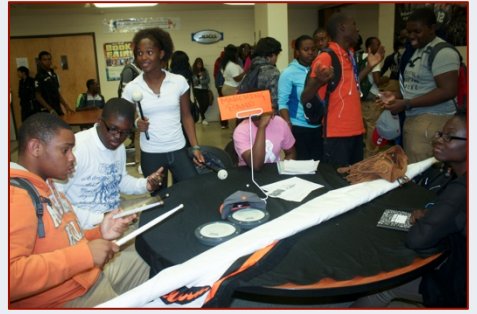
Pictured: Portfolio Development display; Film Club display; OHS Band display.