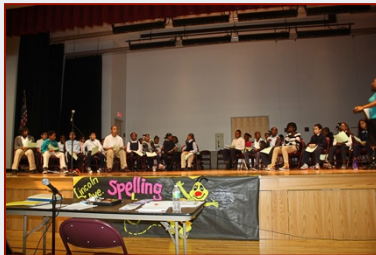
Pictured: Scenes from Lincoln Avenue School's Spelling Bee held on December 4, 2012