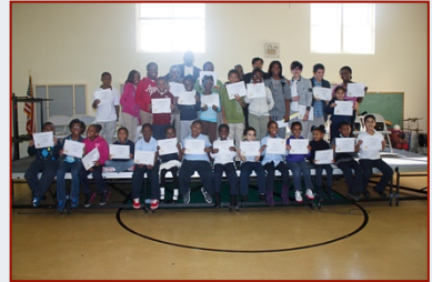
Pictured: Scenes from Forest Street School's Spelling Bee held on November 26, 2012