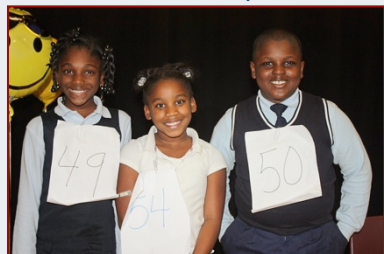
Pictured: Scenes from Park Avenue School's Spelling Bee held on November 12, 2012