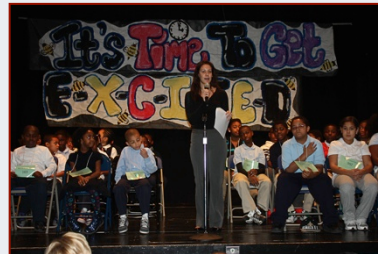
Pictured: Scenes from Heywood Avenue School's Spelling Bee held on November 16, 2012