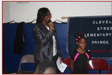
Pictured: Scenes from Cleveland Street School's Spelling Bee held on November 13, 2012