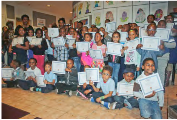
Pictured: Heywood's students with their certificate.