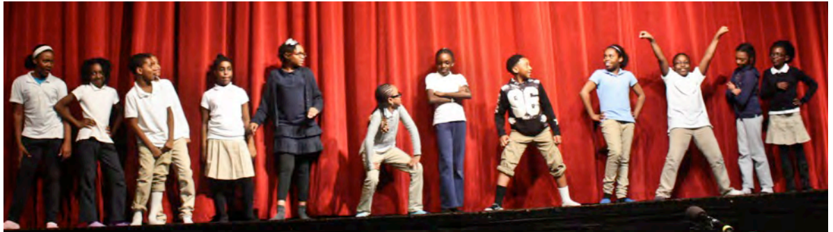
Pictured: Heywood students' "Respect" dance performance.