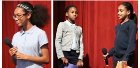
Pictured: Heywood students open the program at the November Board of Education Meeting.

who read their school essays on respect. The essays highlighted respect for self, others and your school.