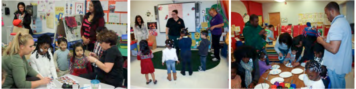
Pictured: Scenes from El Día de Los Niños y Los Libros.

On November 19, the Department of Early Childhood Education held El Día de Los Niños y Los Libros (The Day of the Children, the Day of the Book) at the Orange Early Childhood Center. El Día is a celebration designed to support literacy at home, celebrate culture and strengthen the home school connection. The event emphasized the importance of advocating literacy for children of all linguistic and cultural backgrounds.