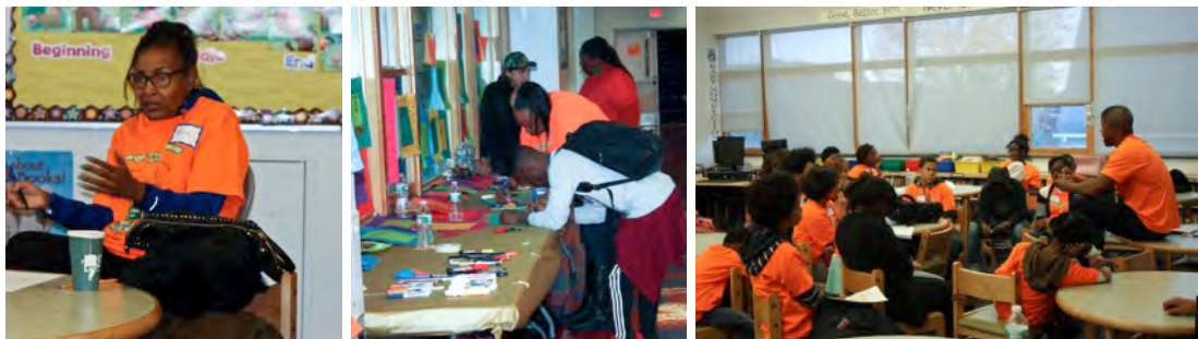
Pictured: Scenes from the Teen Summit 2015 including adult and student workshops and activities.