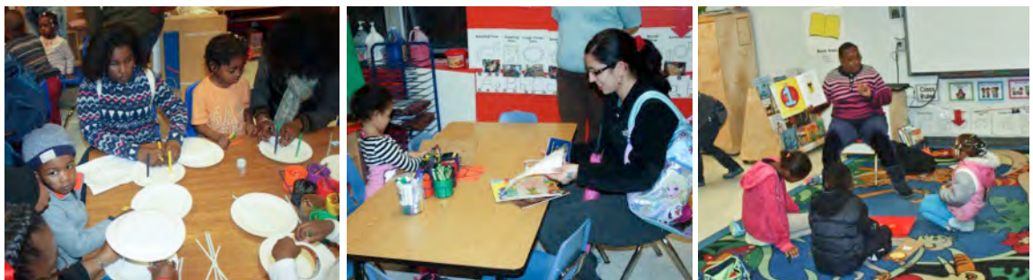
Pictured: Scenes from El Día de Los Niños y Los Libros.