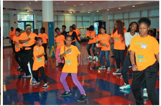
Pictured: Scenes from the Teen Summit 2015 including adult and student workshops and activities.

See full details in a future Weekly Email Blast.