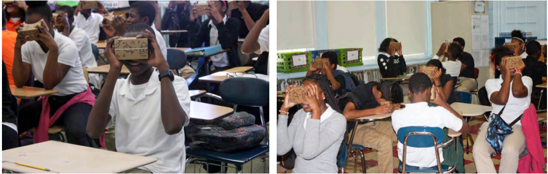
Pictured: Students at The Prep explore far-away places.