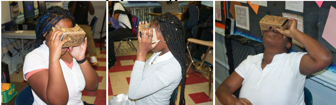
Pictured: Students at The Prep explore far-away places.