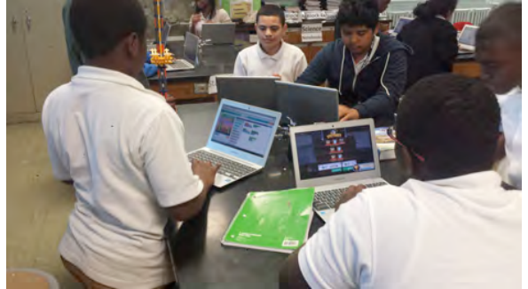
Pictured: OPA STEM club students coding their way to success! ( www.code.org )