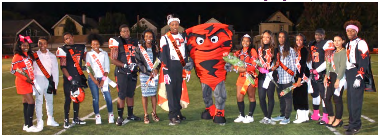
Pictured: The 2015 Homecoming Court poses with the Tornadoes Mascot.