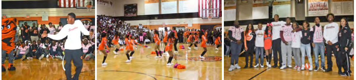
Pictured (left to right): Dance-off; OHS Cheerleaders; Homecoming Court.