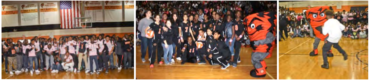
Pictured (left to right): OHS Tornadoes Football Team; Girls Volley Ball Team; Dance-off.