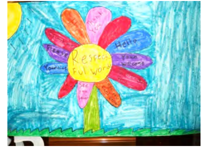
Pictured: Week of Respect activities at Heywood Avenue School.

The week's activities ended with an assembly ( pictured above ) that featured a video starring Heywood students, "Respect Essay" contest winners, a dance performance, and musical selections by the Heywood Drumline.