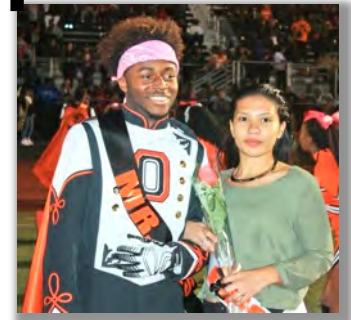
Pictured (left to right): Mr. and Ms. Senior; Mr. and Ms. International; Mr. and Ms. OHS.