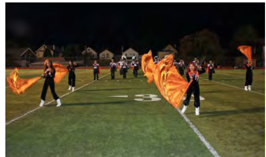
Pictured: The Mighty Marching Tornadoes, Dancers and Twirlers entertain during halftime at the Homecoming Game.