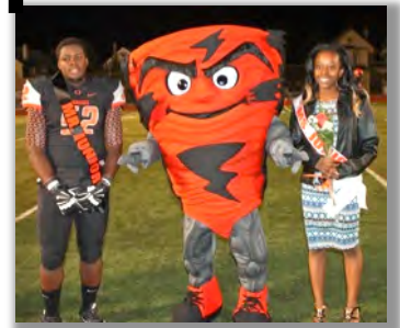
Pictured (left to right): Mr. and Ms. Freshman; Mr. and Ms. Sophomore; Mr. and Ms. Junior.