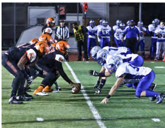
Pictured: OHS Tornadoes vs. the Millburn Millers at the Homecoming Game on October 16.

The Tornadoes have a 6 - 0 record going into the annual Pink Out Game on Saturday, October 24 at 1:00 p.m., at Bell Stadium.