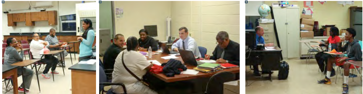
Pictured: Scenes from classroom visits.