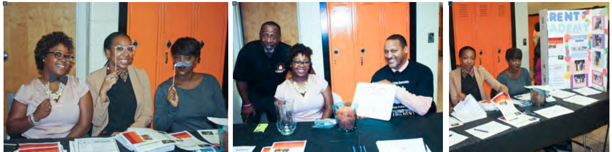
Pictured: (left to right): Parent Academy (PA) members ready with information for parents; Parent Academy and PTSO members ready to recruit participants; PA information being displayed.