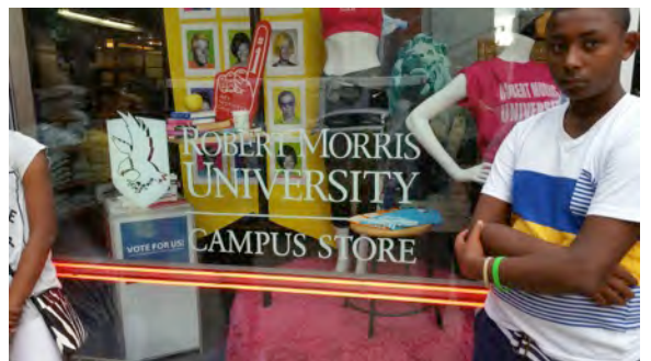
Pictured: Scenes from Oakwood's visit to the "Windy City."