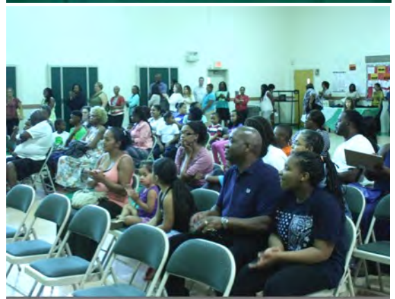
Pictured: Scenes from OACS Back-to-School Night.