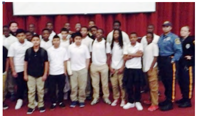
Pictured: Eight grade Prep students pose with members of the Juvenile Justice Commission.