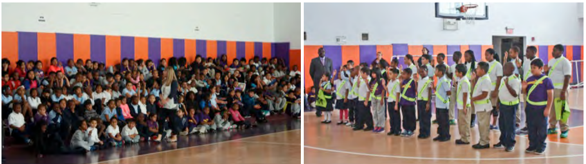
Pictured (left to right): Students watch the ceremony; The Induction Ceremony.