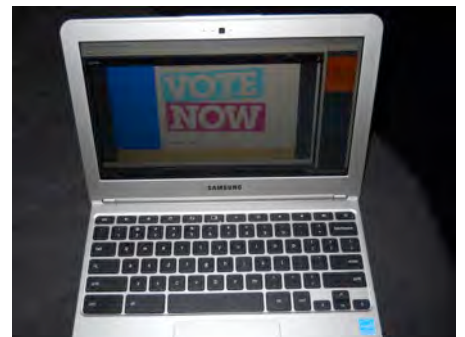
Pictured: Student Government Elections at Heywood Avenue School.