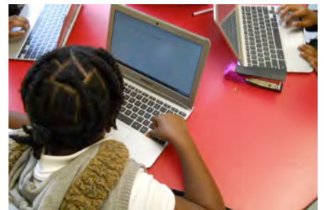
Pictured: Student Government Elections at Heywood Avenue School.