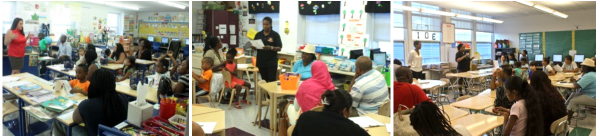
Pictured: Lincoln Avenue classroom visits.