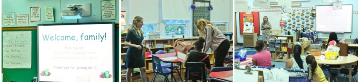
Pictured (left to right): Heywood classroom and classroom visits by parents.