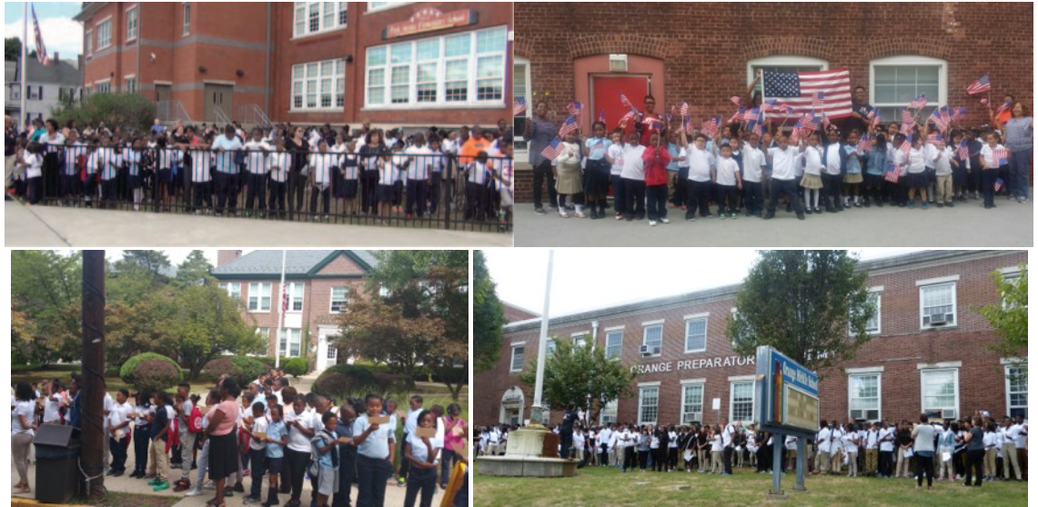
Pictured above: Lincoln, OECC II, Cleveland, OACS, RPCS, Forest, Park, Lincoln, Heywood and “The Prep,” participating in the National Anthem Sing-Along.