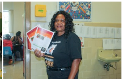
Pictured above: Scenes from around the district on the first day of school.

Contact Information: Orange Board of Education 451 Lincoln Avenue Orange, NJ 07050 Send Us An Email