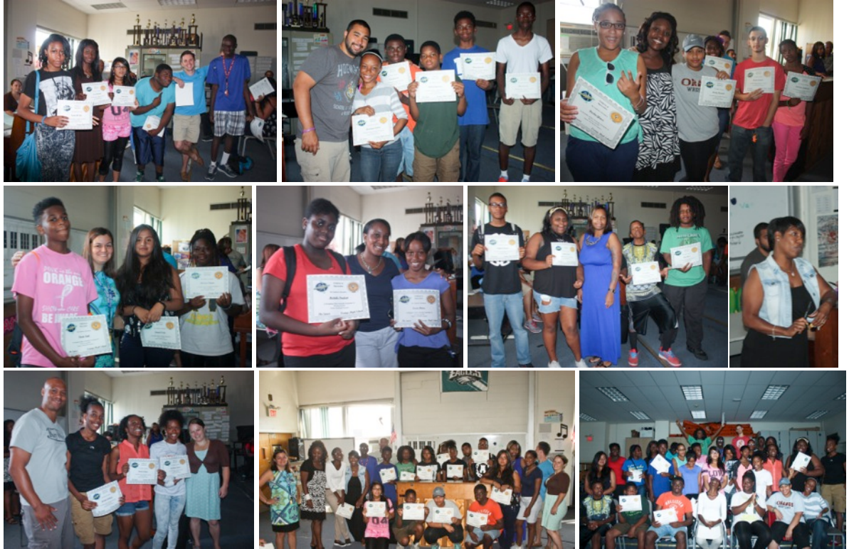
Pictured: The Summer Transitional Program certificate awards presentation.