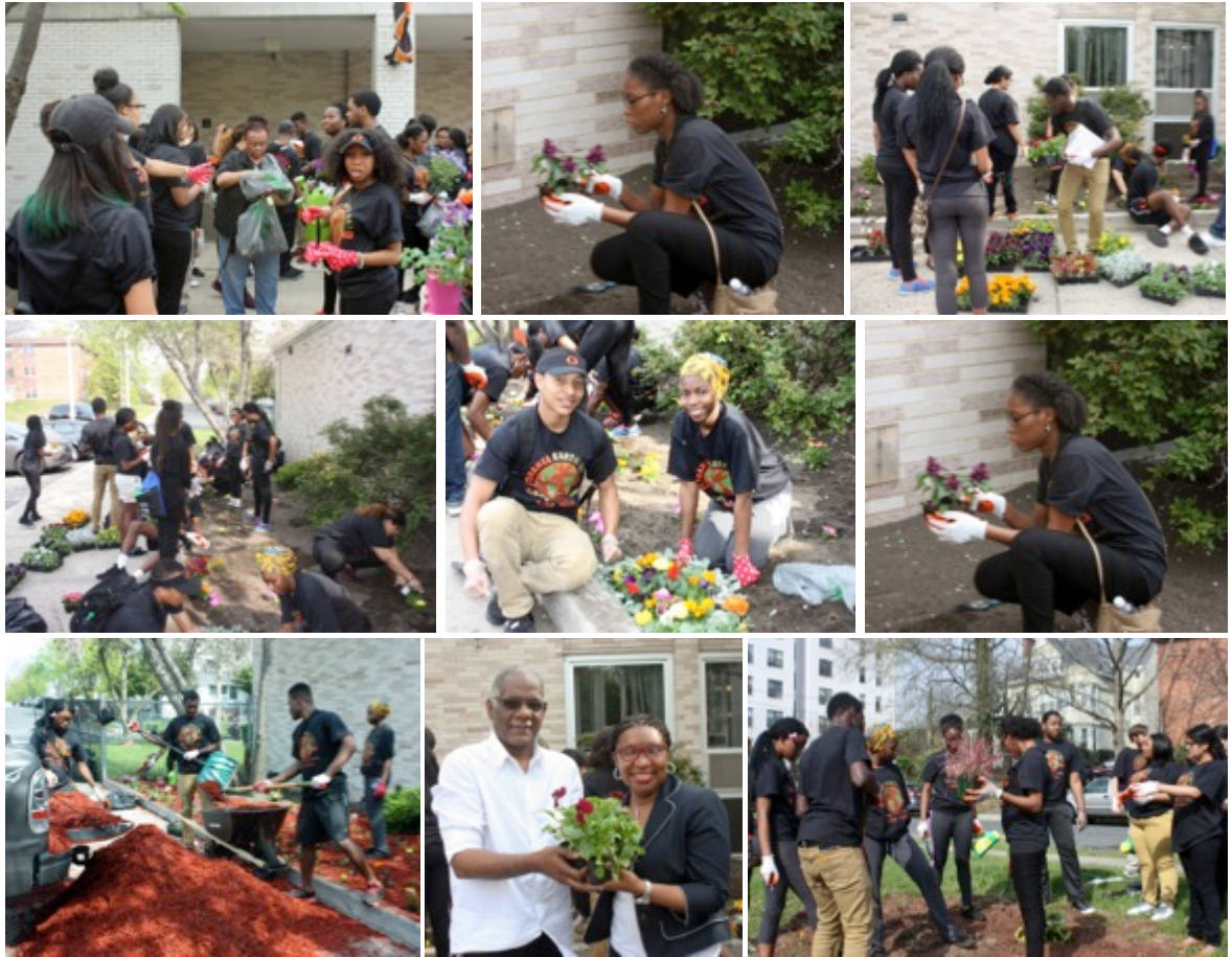
Pictured: Scenes from the OHS Earth Day event.