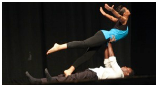
Pictured (above and left): Orange Prep presentation slide and dancers.