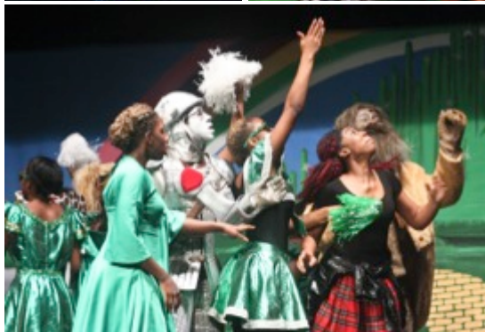
Pictured (above): Scenes from the Wiz .