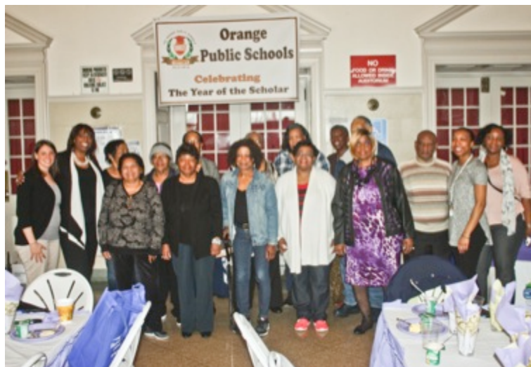
Pictured: Group photo of Grandparents Day participants and Orange Prep administration and staff.

The event gave grandparents the opportunity to meet Orange Prep staff and interact with their peers. Finally, all participating grandparents received a Recognition/ Appreciation certificate from the school administration and Community Room staff.