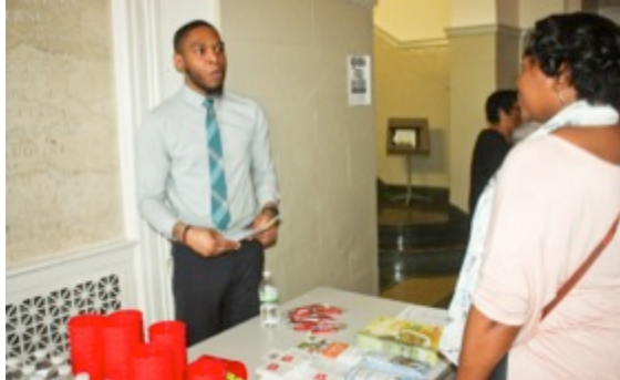
Pictured: Walgreens representative speaking with Prep staff.