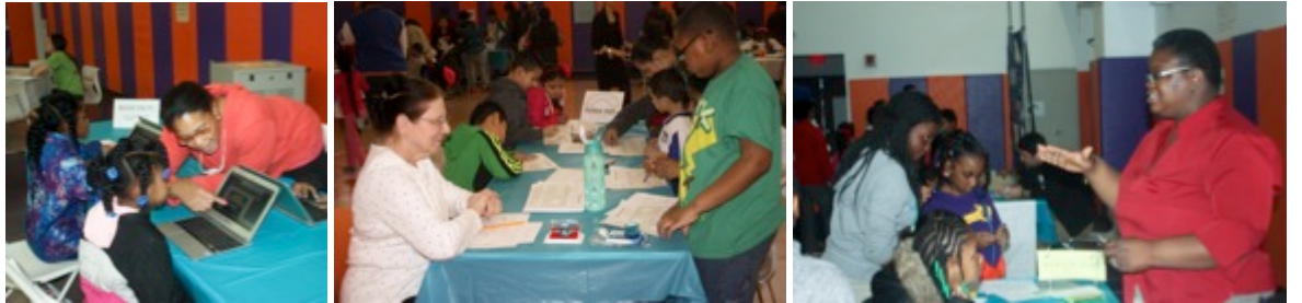
Pictured: Scenes from RPCS Math Night.