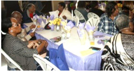
Pictured: Grandparents at appreciation event.