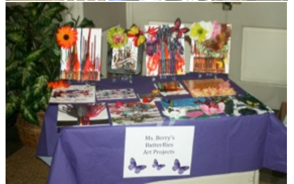
Pictured: Scene from the Grandparents Day Celebration at Orange Prep.