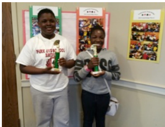
Pictured (left to right): Second place winners at the Unit 106 Sectional Bridge Tournament; Third place winners at the Unit 106 Sectional Bridge Tournament.