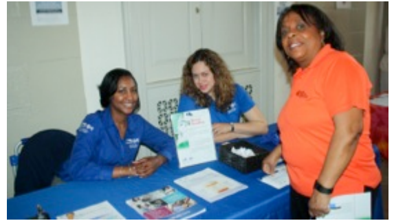
Pictured: Horizon Blue Cross Blue Shield representatives speaking with Prep staff.