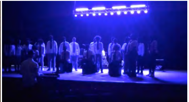
Pictured (left to right): ViH group photo and during the March 11 performance at KIC.