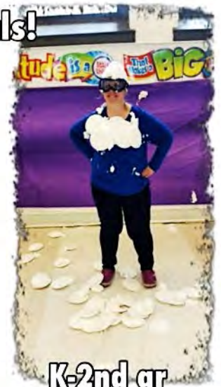
K-2nd gr bought 49!