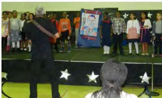
Pictured: Scenes from A Night at the Apollo .