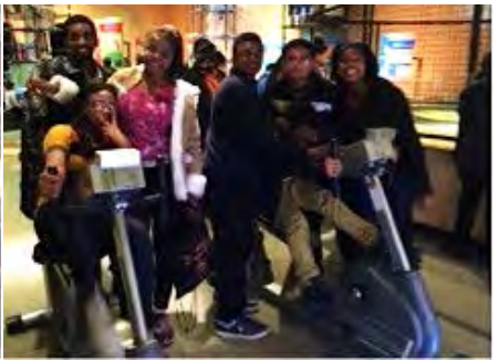
Pictured: Scenes from OPA's STEM family night at Liberty Science Center.