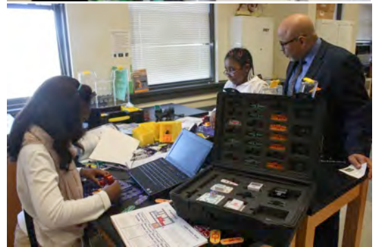
Pictured: Open House at Scholars Academy, including Math, ELA, STEM and Science classes.