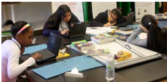
Pictured: Open House at Scholars Academy.