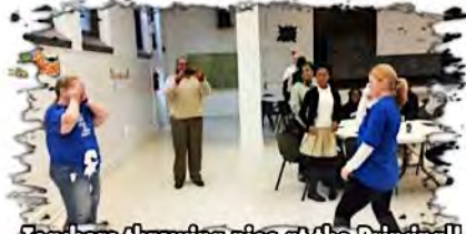
Teachers throwing pies at the Principal! True story!