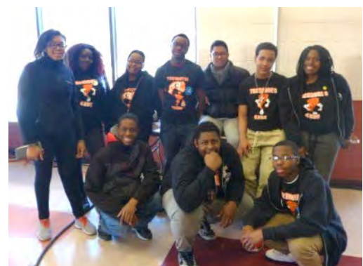
Pictured (above): Torbotix at the First Stronghold competition at Mt. Olive High School.