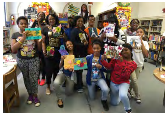
Pictured (above and left): Berry's Butterflies showing their artwork.