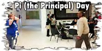
Pi (the Principal) Day