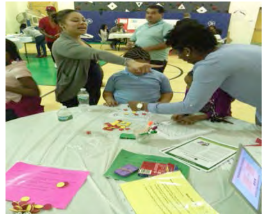
Pictured: Scenes from Family Math Night .