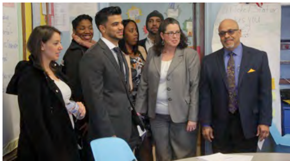
Pictured: Assistant Principals at Scholars Academy.

Students were engaging, as they explained their activities to visitors.