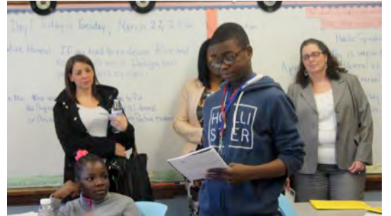
Pictured: Open House at Scholars Academy, including Math, ELA, STEM and Science classes.