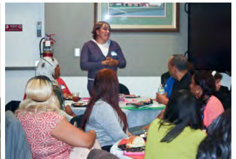
Pictured: Parent introductions during the Parent Academy 2016 Welcome Reception.