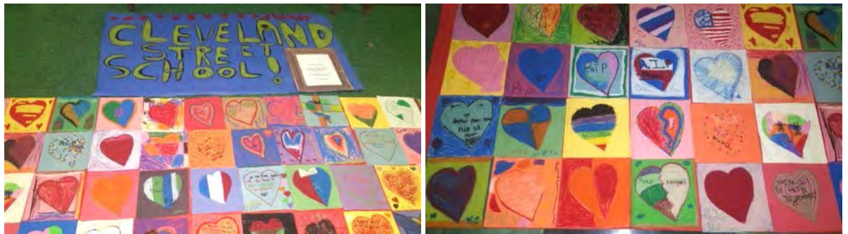
Pictured: Our Hearts Memorial by Cleveland Street students.