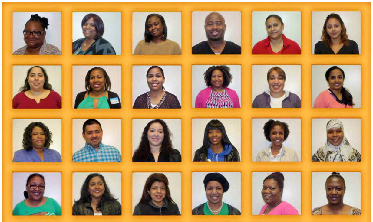
Pictured: 2016 Parent Academy members, listed below.

The Parent Academy's mission is to support overall student achievement by providing families with learning opportunities and resources that will enable them to become more involved in their children's educational success.