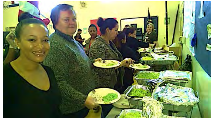
Pictured: Scenes from Forest Street School's Dr. Seuss Green Eggs and Ham Breakfast.