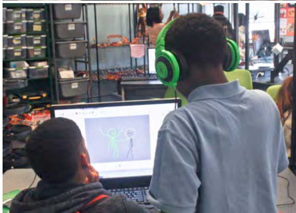
Pictured: Open House at Scholars Academy, including Math, ELA, STEM and Science classes.