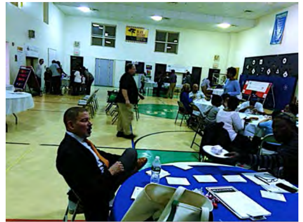
Pictured: Scenes from Family Math Night.

The Family Math Night was a huge success, with community support from both Jersey Mike’s Subs and Master Pizza. They are thanked for their donations and continued support of Forest Street School.