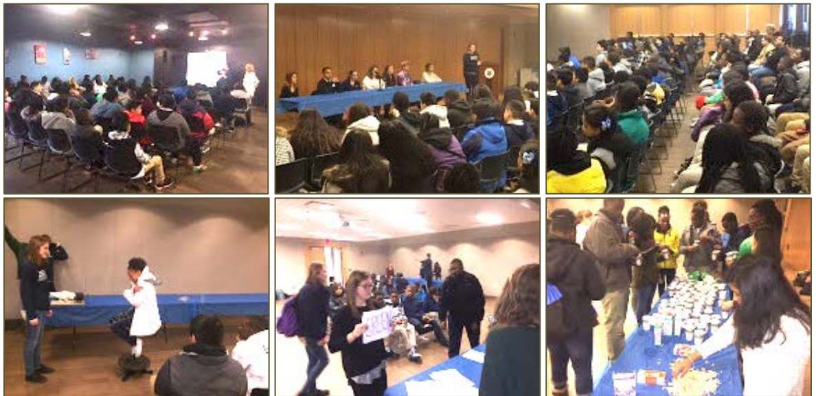
Pictured: RPCS students at Drew University.