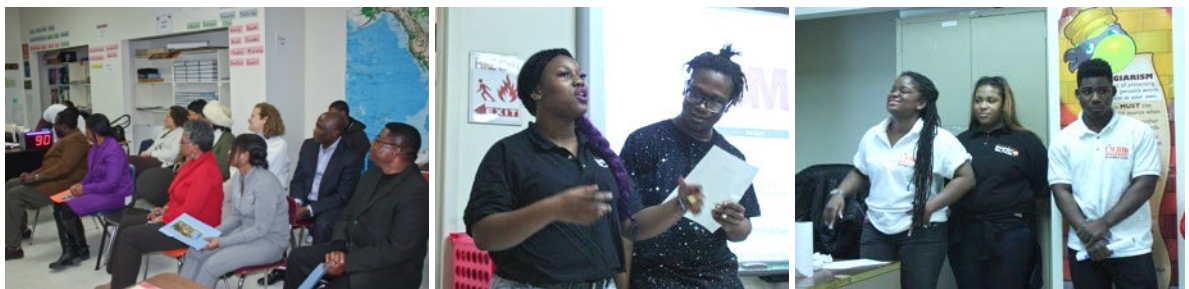
Pictured: Guests listening to Agricultural Revolution Quiz Show; HIB presentation.