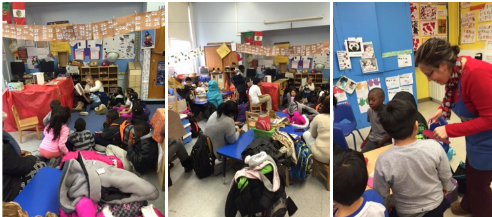
Pictured: Scenes from the PALS event.

The RPCS Preschool staff lead the group in literacy rich activities such as stories, songs and games that focus on rhyming, comprehension and phonemic awareness. In addition, the facilitators highlighted how adults might do a similar activity at home. The RPCS team offered the program in English, Spanish and Haitian-Creole. Every child attending the program was able to select a new book for his or her home library. All participants enjoyed a snack and created a craft related to the focus of the afternoon: HEARTS and LOVE. The staff members know that everyone left PALS more in LOVE with reading than ever before!