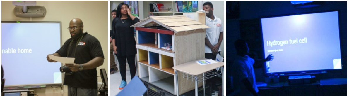
Pictured: Sustainable Home/Renewable Energy presentation.