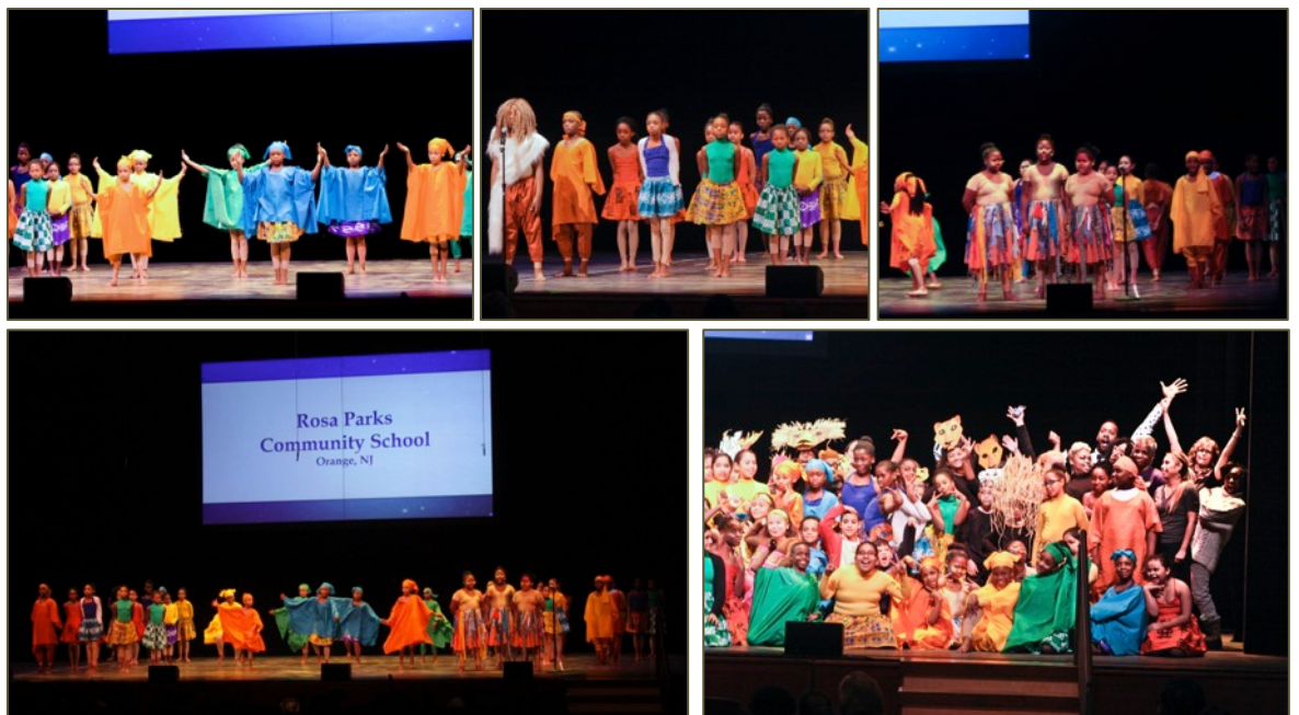
Pictured: Scenes from RPCS's performance at NJPAC.

The event was well attended by friends and family, along with school officials.