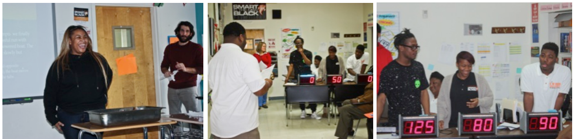
Pictured: Demonstration of the Steamboat Project; Agricultural Revolution Quiz Show.