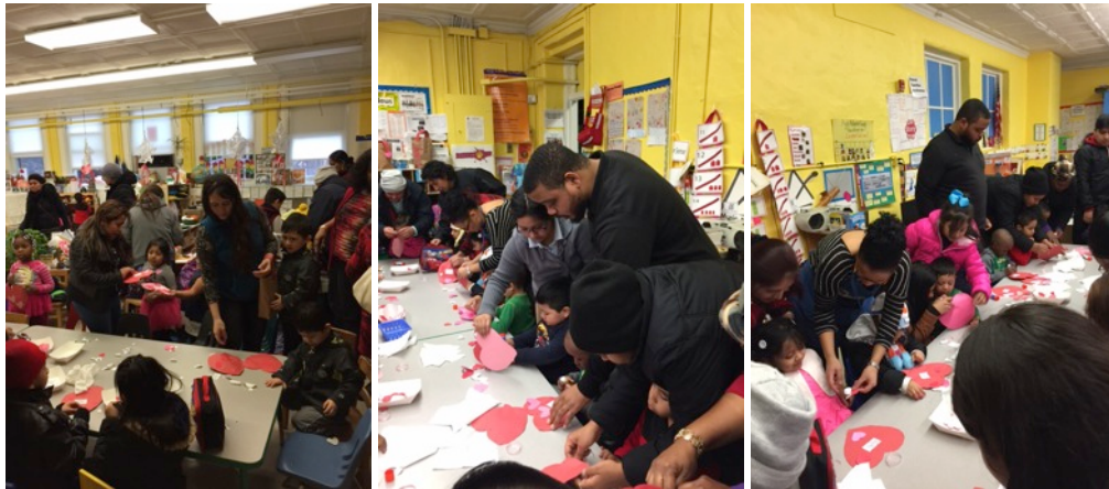
Pictured: Scenes from the PALS event.

PALS was born out of an initiative to celebrate parents as their child's first teacher, to provide families with a format to experience the joy of literature and to help parents reinforce important early literacy skills at home. The program establishes and sustains a home school connection and supports preschool student achievement.