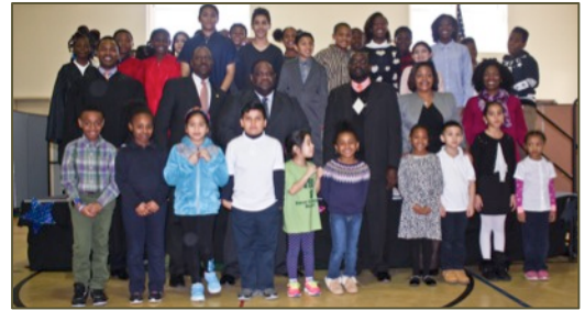
Pictured: Inductees and dignitaries.