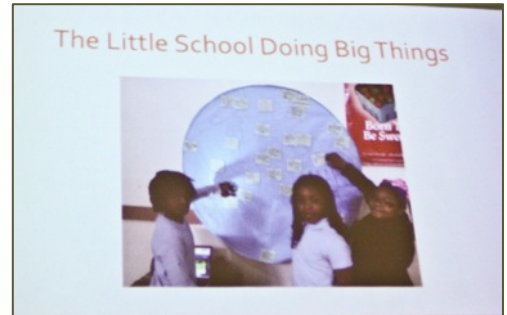
Pictured: OACS Presentation Slide.