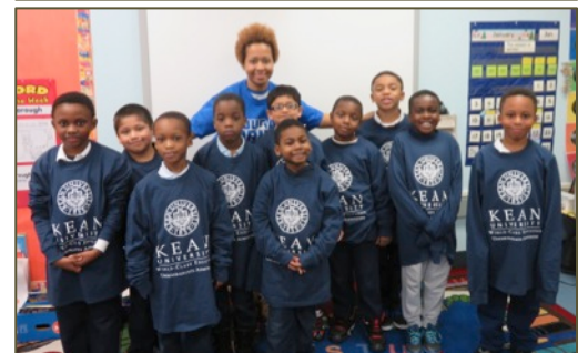
Pictured (above and left): College and Career Day at Heywood Avenue School.