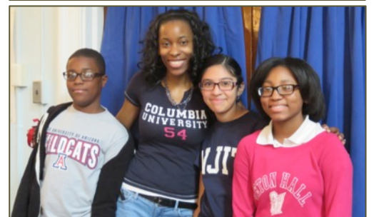
Pictured (above and left): College and Career Day at Heywood Avenue School.