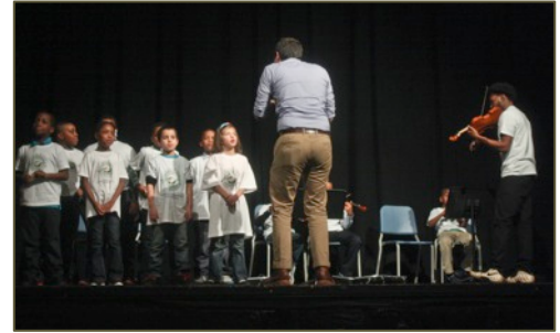
Pictured: Sonic Explorations.