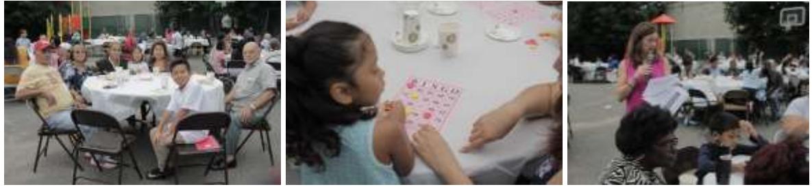
Pictured: Scenes from Grandparent's Day at Forest Street Community School.