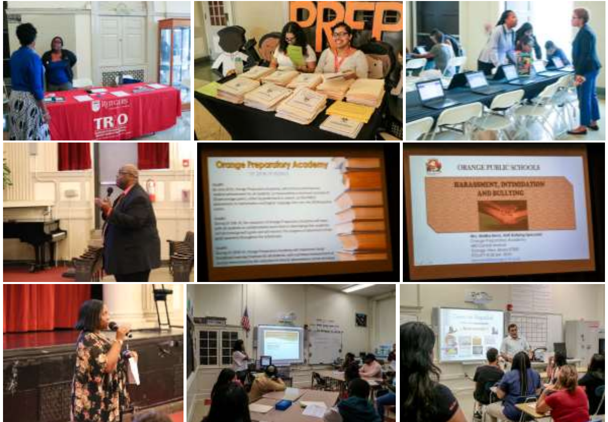
Pictured: Scenes from Back to School Night at Orange Preparatory Academy.

by subject area, to discuss curriculum and expectations for 8 th and 9 th grade students. The hallways were decorated with encouraging posters for all to see ( pictured above ).