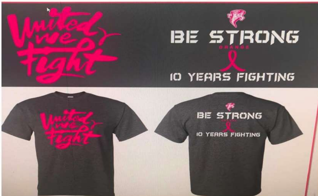
Front of T-shirt

(All proceeds/donations will be donated to the American Cancer Society on October 6 th at the game).