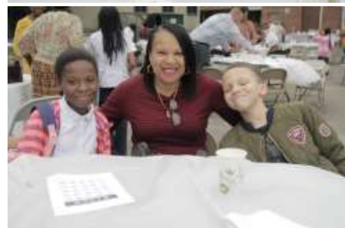
Pictured: Scenes from Grandparent’s Day at Forest Street Community School.