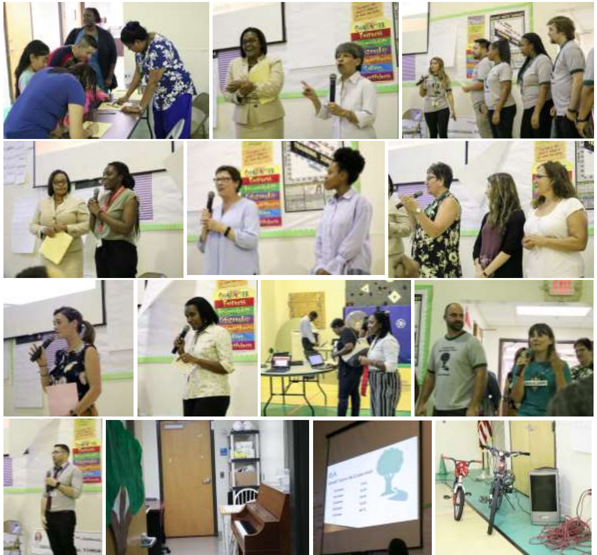
Pictured: Scenes from Back-to-School Night at Forest Street Community School.