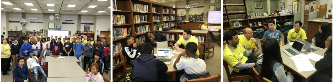
Pictured: Scenes from the EY event at Orange High School.