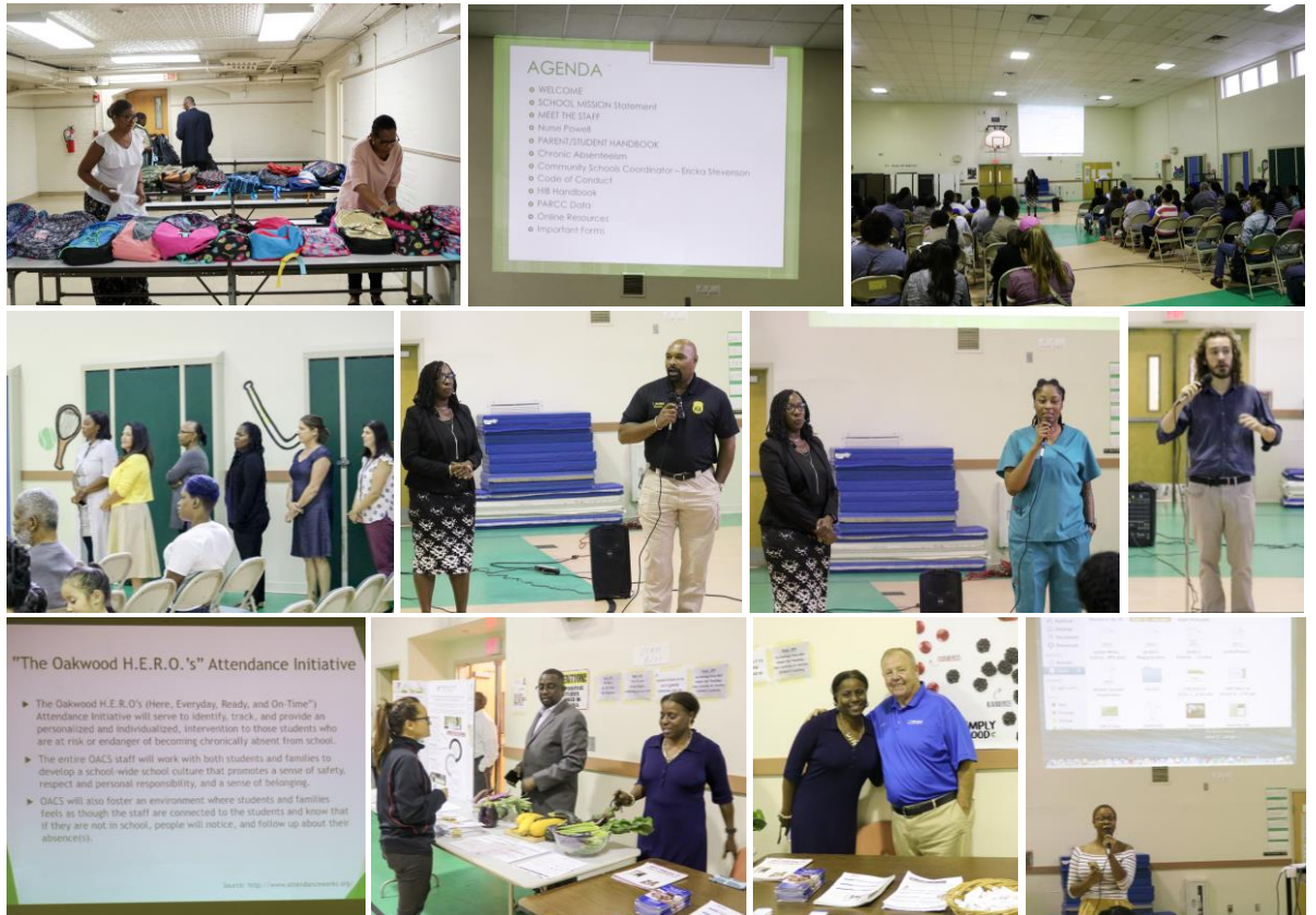
Pictured: Scenes from OACS Back to School Night.