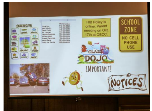
Pictured: Scholars Academy Back to School Night.