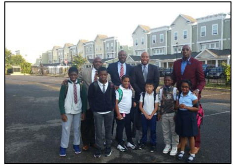
Pictured: "A Few Good Men" at Oakwood Avenue Community School.