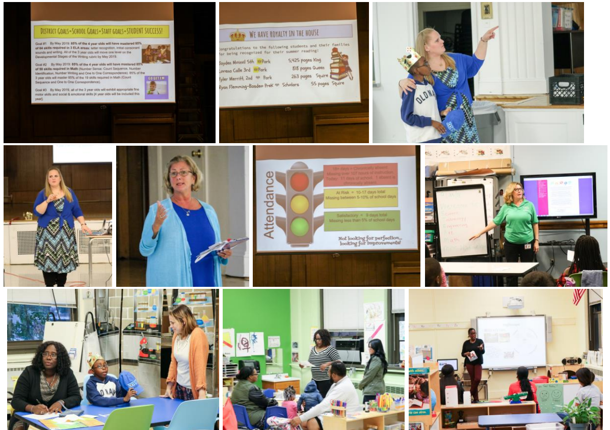
Pictured: Scholars Academy Back to School Night.