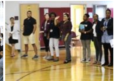
Pictured: Scenes from Lincoln Avenue School's Back to School Night.