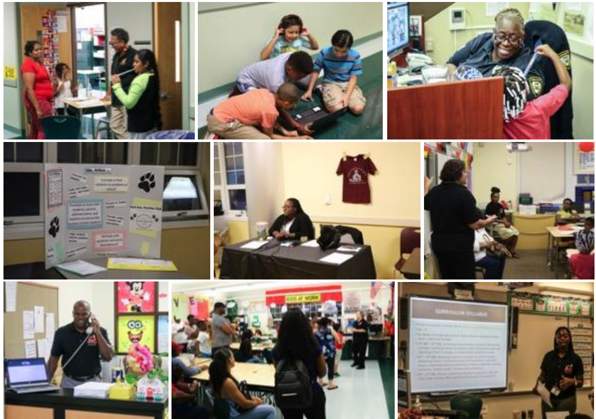
Pictured: Scenes from Back to School Night at Park Avenue School.