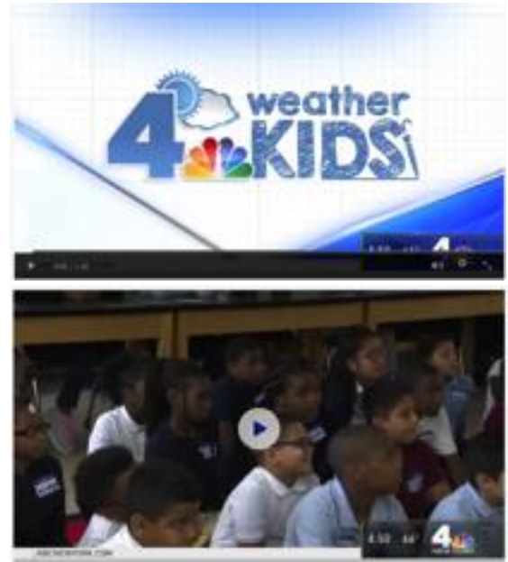
Click here for NBC Universal News 4 Weather Kids - Park Avenue School