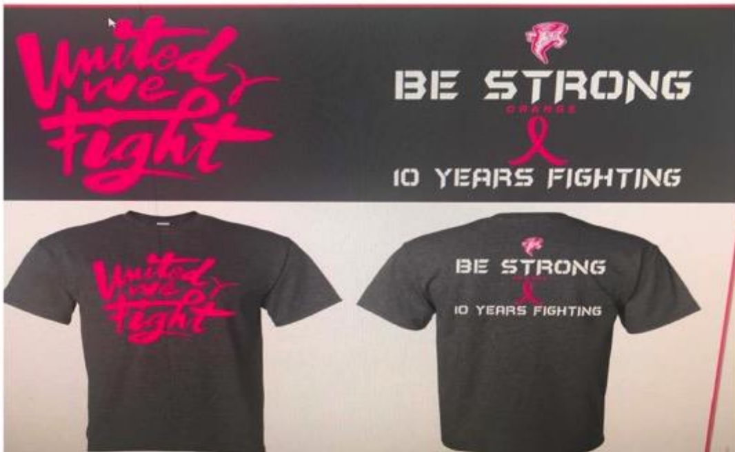
Front of T-shirt

(All proceeds/donations will be donated to the American Cancer Society on October 6 th at the game).