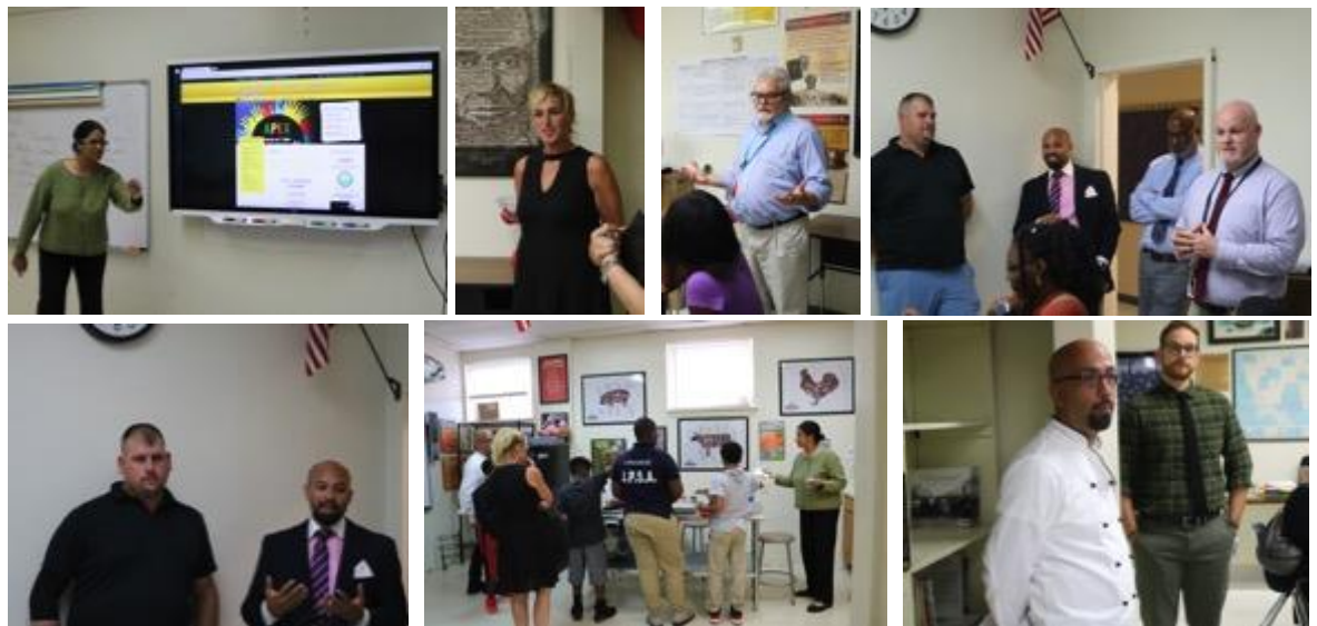
Pictured: Scenes from the APEX Back to School Night.

introduced themselves and met with parents to discuss expectations. The culinary teacher and students prepared snacks for guests.