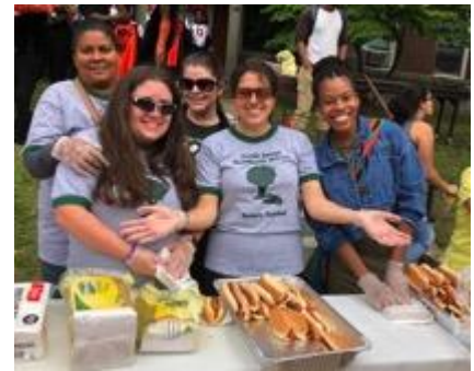
Pictured: Scenes from the Back To School Kick Off at Forest Street Community School.