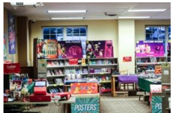
Pictured: Park Avenue School Book Fair.

Classroom visits were held, as well as visits to the library where parents purchased books for home, during the Back to School Book Fair.