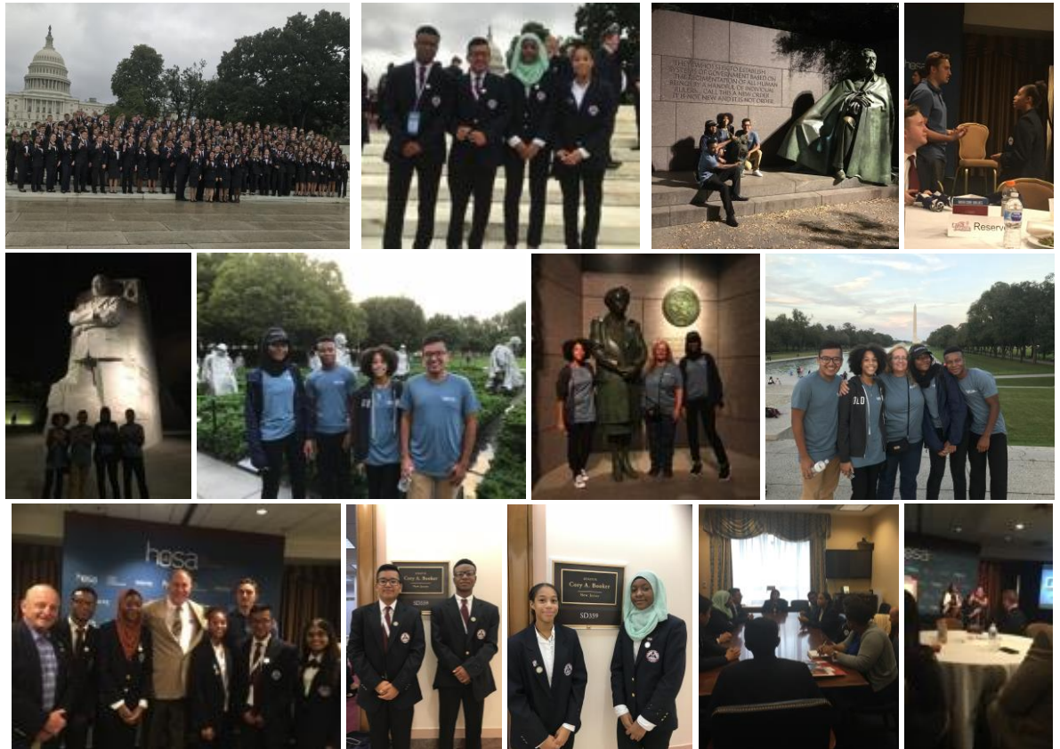
Pictured: Scenes from the HOSA student visit to Washington D.C.

The Academy allowed all the opportunity to network and build connections nationally. The goal of the HOSA team will be to impart the skills and mindset needed to learn, lead, serve, and innovate in all aspects of HOSA-Future Health Professionals with our local chapter at Orange High School.