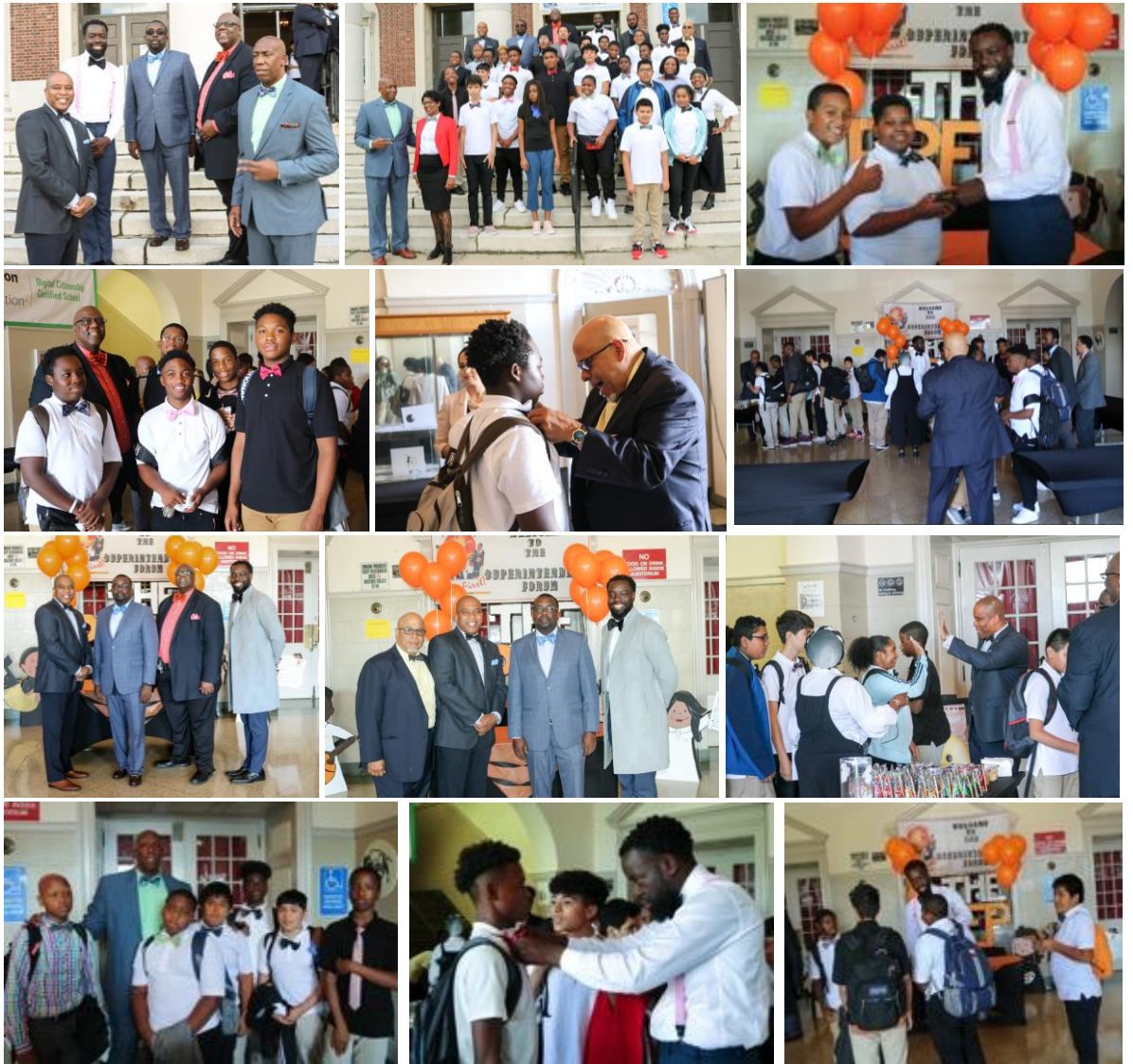
Pictured: Bow Tie Wednesday at Orange Preparatory Academy.