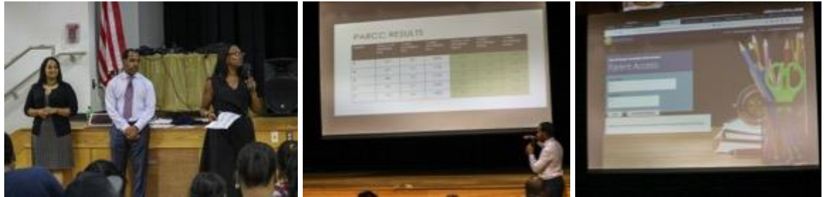
Pictured: Scenes from Lincoln Avenue School's Back to School Night.