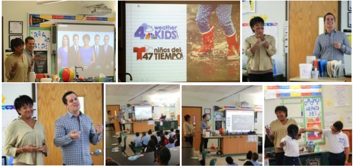
Pictured: News 4 Weather Team gives a lesson on the weather at Park Avenue School.

Students were presented with certificates and acknowledged as News 4 Weather Kids. The class was also given weather posters before going outside to see the Storm Chaser 4 vehicle and learn about weather technology.