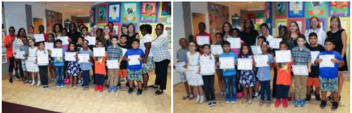
Pictured: Scenes from Lincoln Avenue School's Board Lobby Art Opening.