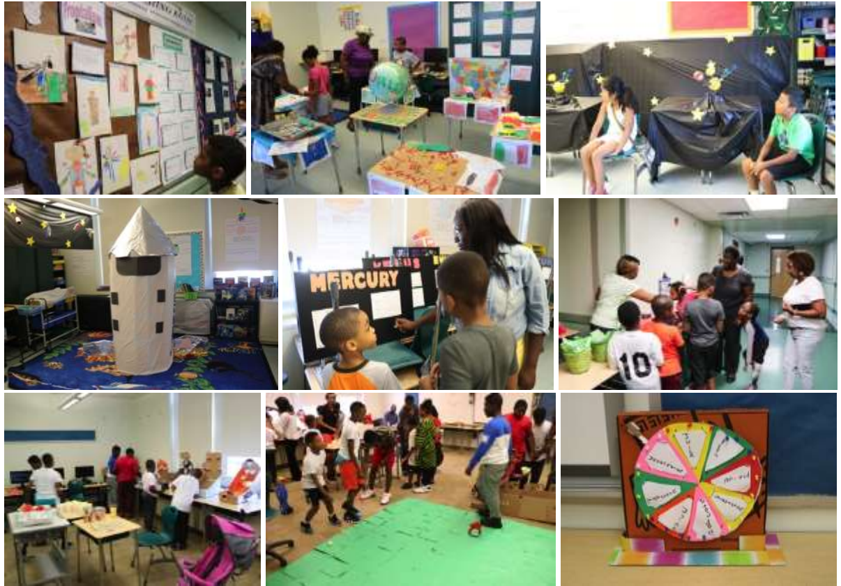
Pictured: Scenes from the Department of Special Services 4th annual Extended School Year (ESY) celebration.