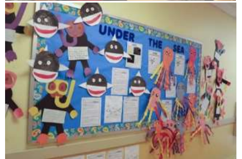
Pictured: (above and left): Scenes from the 4th annual Extended School Year (ESY) celebration.