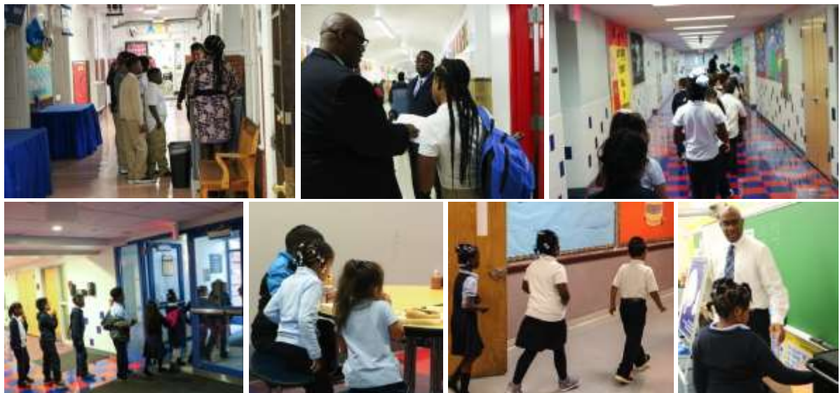
Pictured: Opening day across the district, as students tour their buildings, ask for directions, enjoy lunch and learn new procedures.