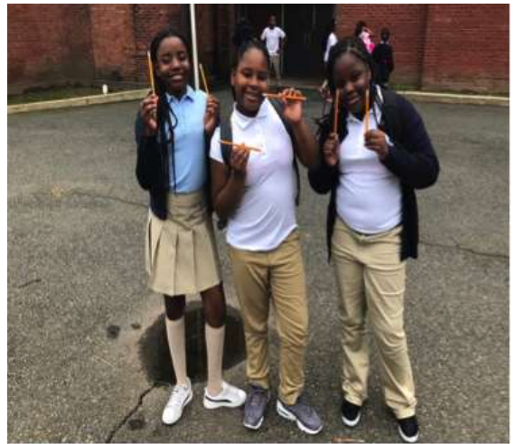
Pictured: Students pose with their new pencils.