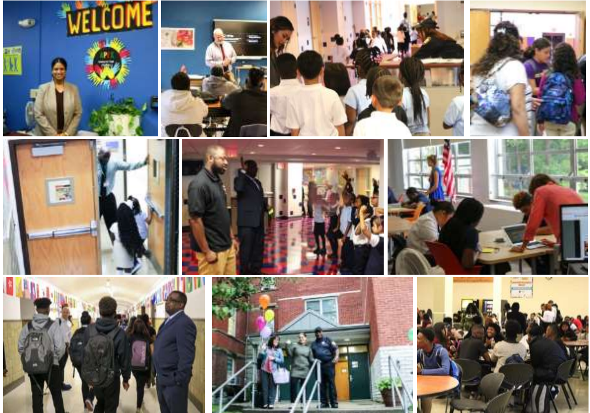
Pictured: Scenes from opening day across the district with staff, administrators and students.

Across the district students greeted friends and their teachers. The younger grades were taken on tours of their buildings, introduced to their security guards, and became acquainted with line-up and hallway procedures. They began school, enjoyed lunchtime and got down to work.