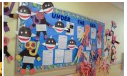
Pictures: Scenes for ESY celebration at OHS and Park Avenue School.

Students who participated in the program made presentations to family, friends and staff, showing their summer's work. The activities varied, depending on grade and covered specific Thematic Units of Study to enhance skills in the core subject areas of: language arts, mathematics, social studies and science.