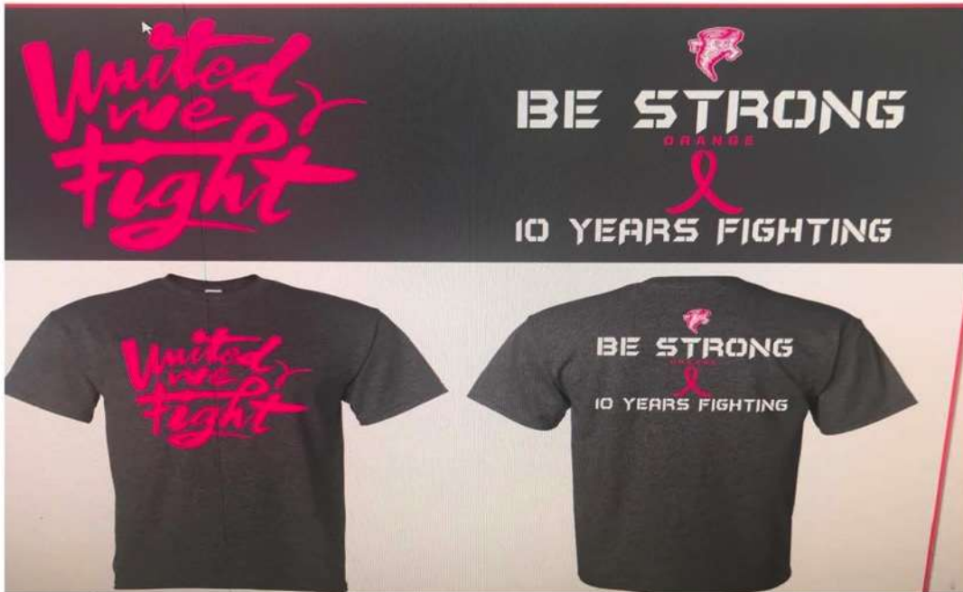
Front of T-shirt

(All proceeds/donations will be donated to the American Cancer Society on October 6 th at the game).