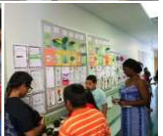
Pictured (above and right): Scenes from the Department of Special Services 4th annual Extended School Year (ESY) celebration.