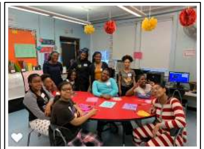
Pictured: Girls Night-In at Heywood Avenue School with Berry's Butterflies and Sister 2 Sister mentees.