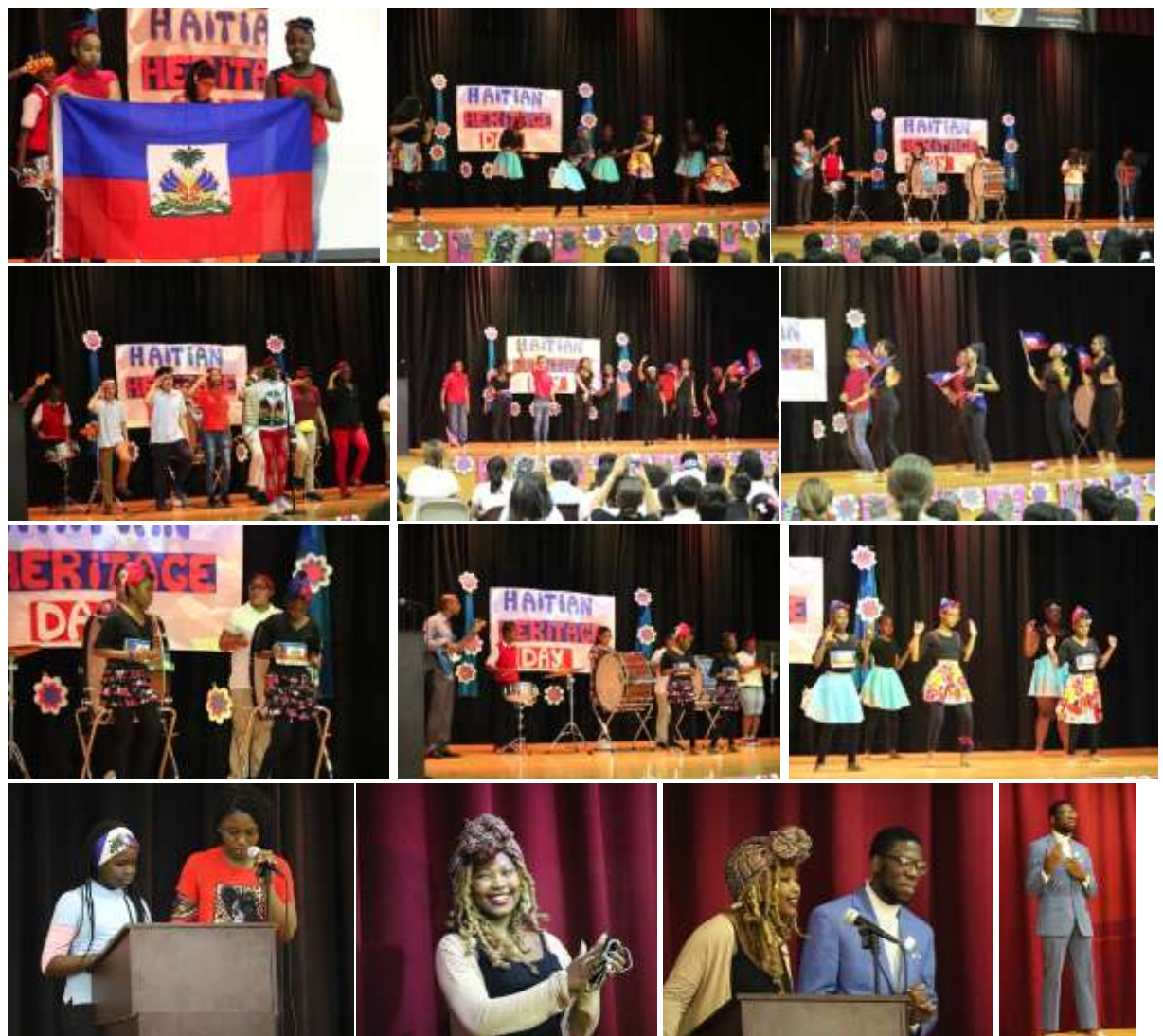
Pictured: Scenes from Lincoln Avenue School's Haitian heritage celebration.

The celebration included recognition of Haitian Flag Day held on May 18, a major patriotic day celebrated in Haiti and by the Haitian diaspora. Students recited the Haitian flag Salute and sang the national anthem of Haiti. The program comprised several energetic dance performances and songs including the patriotic Haitian song “Ayiti Cherie.”