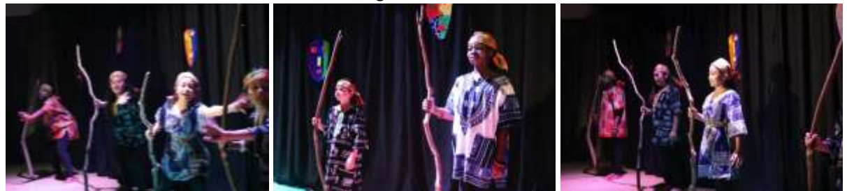
Pictured: Scenes from Disney's Lion King Kids .

Forest Street School presented Disney's Lion King Kids on May 16 -18. The story is an abbreviated version of the Disney movie and long-running Broadway musical, presented in cooperation with Disney Musicals in Schools and the New Jersey Center for Performing Arts. It is the coming of age tale of the young lion cub Simba who is destined to rule Pridelands, as his father Mufasa explains the "Circle of Life," and he happily rejoices "I Just Can't Wait to be King." His destiny is foiled when his uncle Scar kills his father, and he flees the Pridelands, leaving his friend Nala and finding new companions in the jungle with Timon and Pumbaa, who embrace "Hakuna Matata," a worry-free attitude. When Nala goes in search of help because of the disaster created by Scar's leadership and his alliance with hyenas, she discovers her old friend Simba. Nala convinces Simba to return to be the rightful ruler of Pridelands.