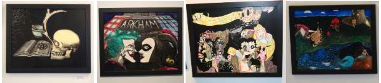
Pictured (left to right): Artwork - Enchanted Study , Crime of Passion , Into My Mind , and A Magic View .