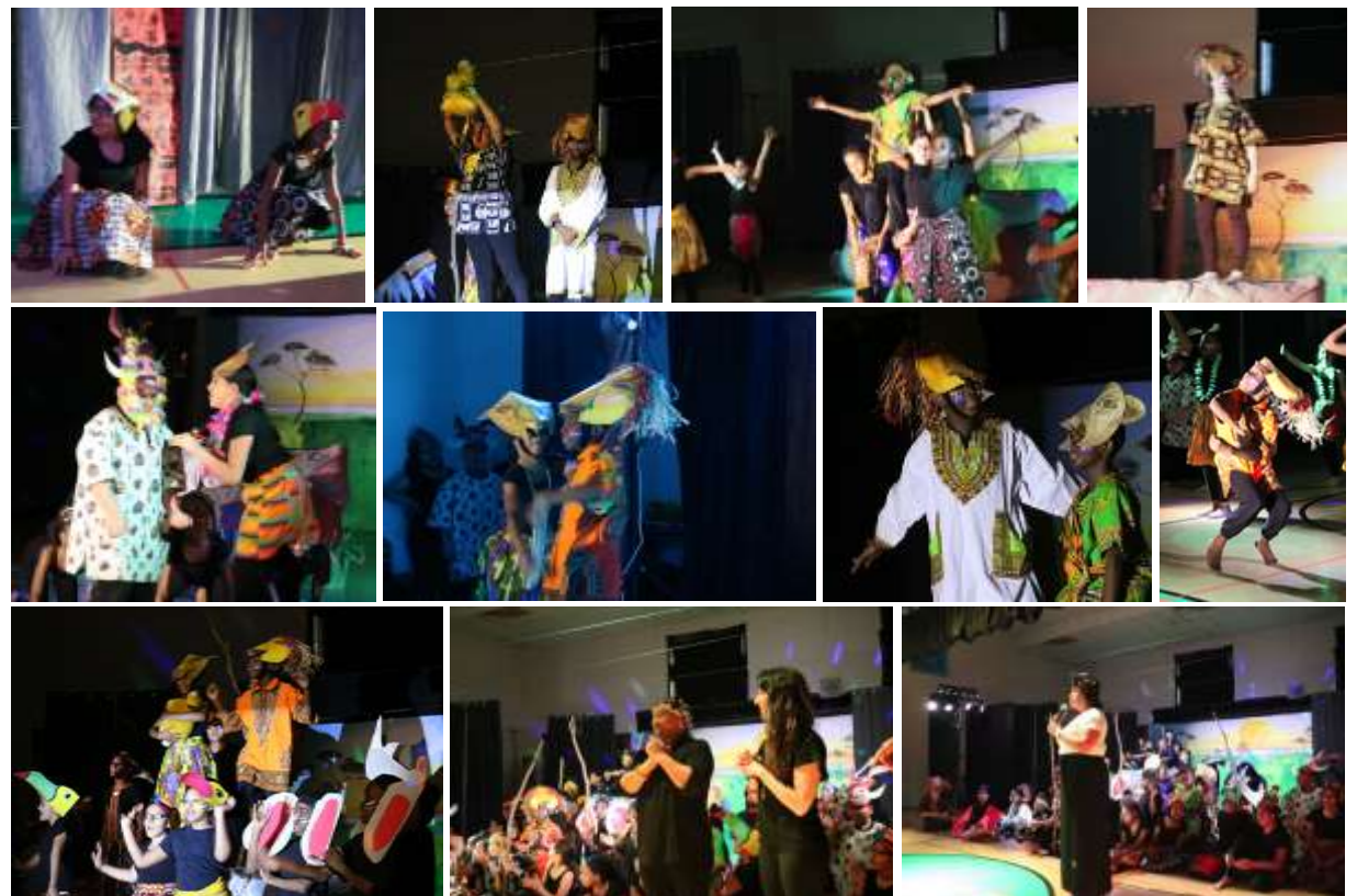
Pictured: Scenes from Disney’s Lion King Kids .