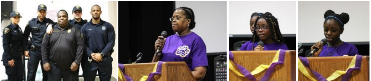
Pictured: Safety Patrol Day at Rosa Parks Community School.