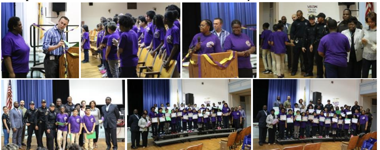
Pictured: Safety Patrol Day at Rosa Parks Community School.