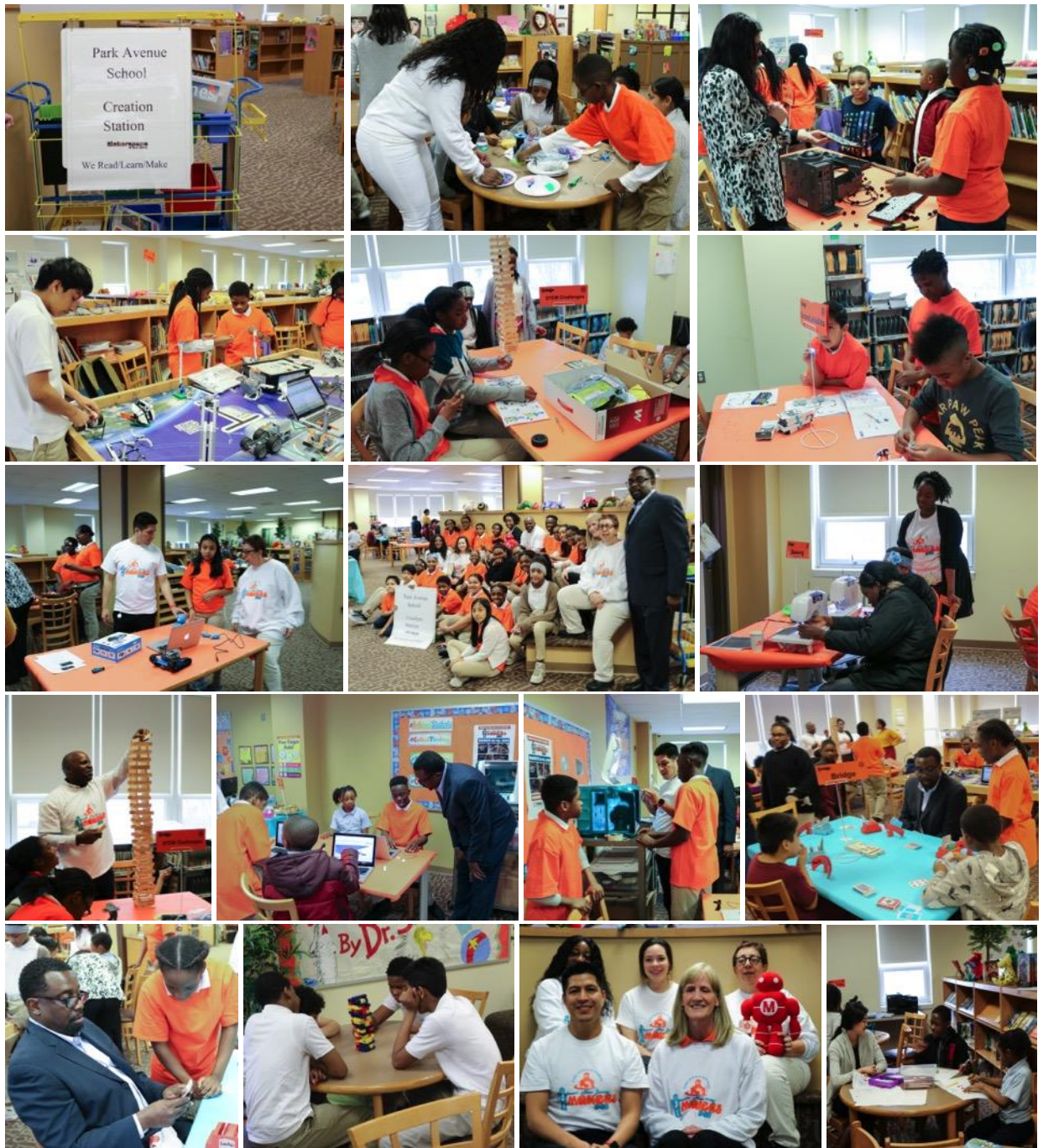
Pictured: Scenes from Park Avenue School's Makers Day.