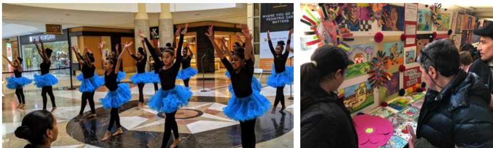
Pictured: Lincoln Avenue students perform at Pride in Public Education in the Livingston Mall