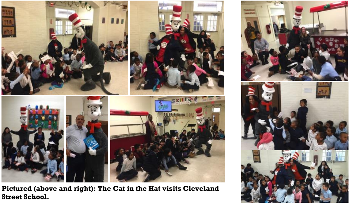
Pictured (above and right): The Cat in the Hat visits Cleveland Street School.