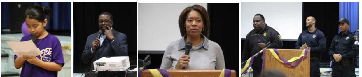
Pictured: Safety Patrol Day at Rosa Parks Community School.