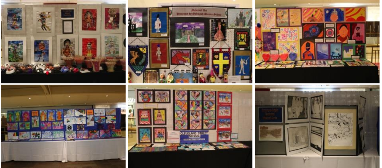
Pictured: Art display at the Pride EXPO at Livingston Mall including work by Orange High School, Orange Preparatory Academy, Rosa Parks and Oakwood Avenue Community Schools, and Park, Lincoln, Cleveland and Heywood Avenue Schools.