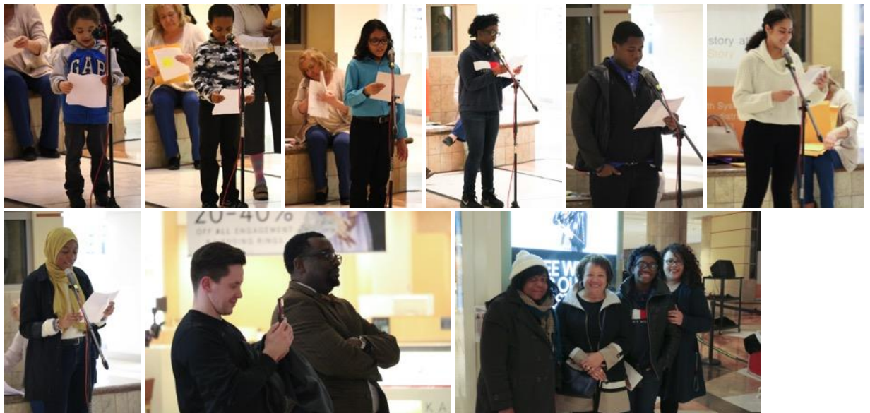
Pictured: Scenes from the Pride EXPO Essay Contest.