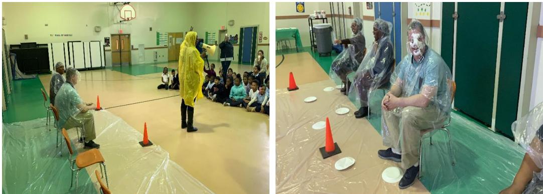
Pictured: Pi Day at Oakwood Avenue Community School.