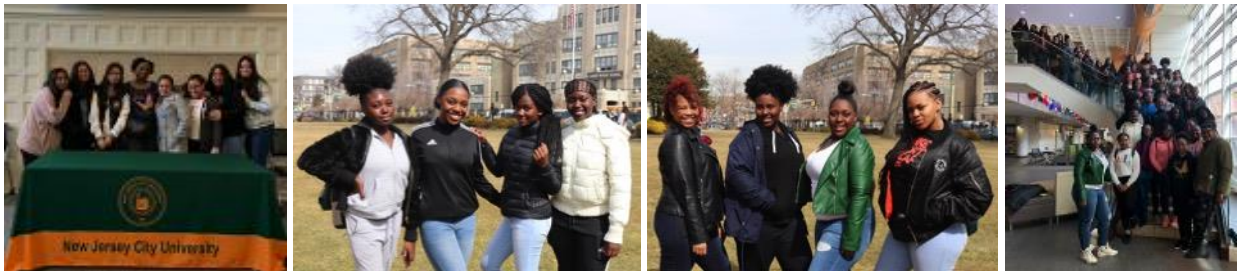
Pictured: Berry's Butterflies at NJCU.