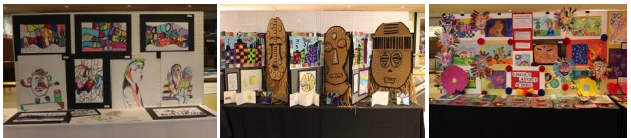
Pictured: Art display at the Pride EXPO at Livingston Mall including work by Orange High School, Orange Preparatory Academy, Rosa Parks and Oakwood Avenue Community Schools, and Park, Lincoln, Cleveland and Heywood Avenue Schools.

Art from district schools were displayed on the upper level of the mall, from March 15-22, joining presentations from other Essex County schools.