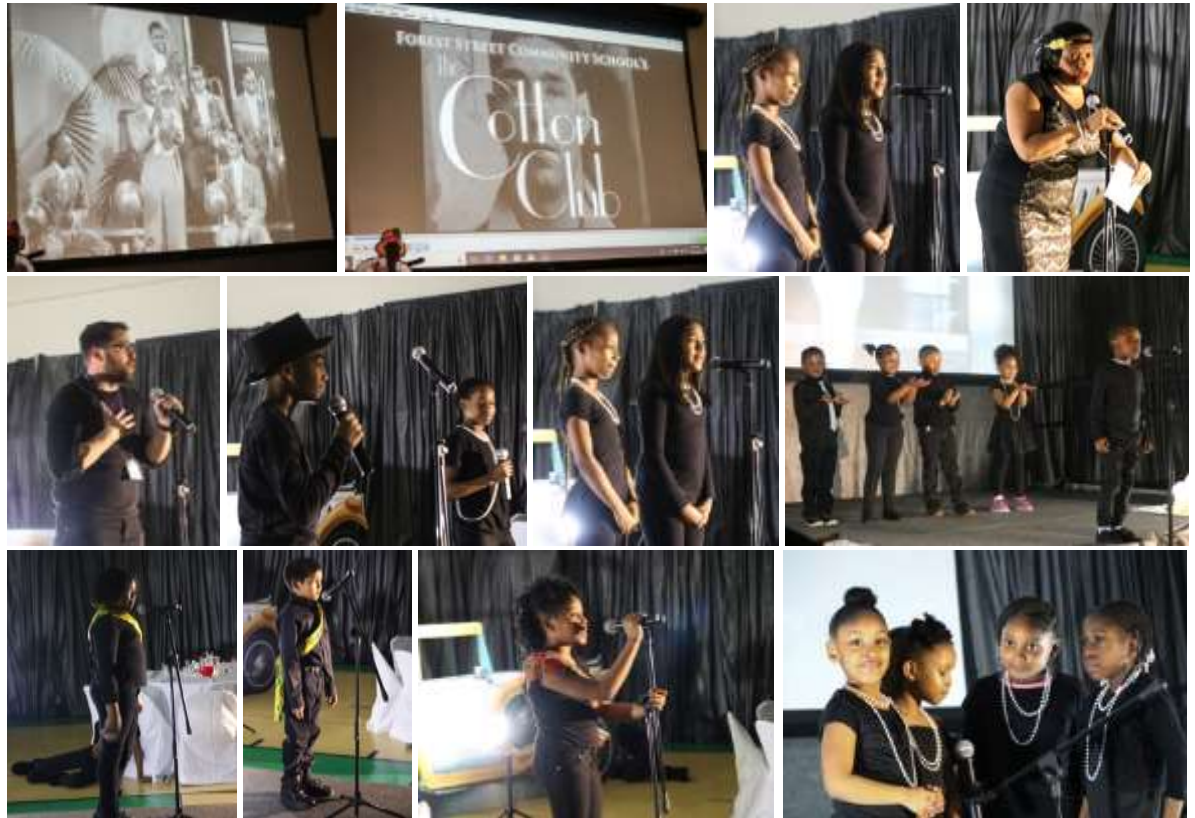
Pictured: Scenes from “A Night at the Cotton Club.”