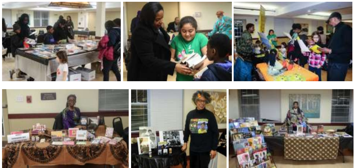
Pictured: Scenes from the Orange Page Turners Reading Challenge, Celebrating Our People, including vendors and participants.

The Orange Page Turners Reading Challenge is a district and city program to have students and the community read two million pages from Thanksgiving to May Day. All were encouraged to register and log their reading . For more information visit the district website at www.orange.k12.nj.us .