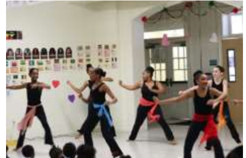
Pictured (above and left): The Premier Dance Theatre's presentation of "Trailblazers."