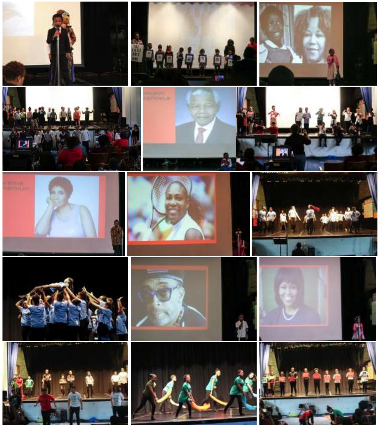
Pictured: Scenes from “We Can Change the World.”