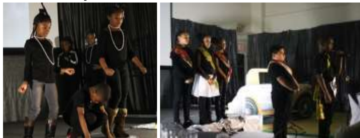
Pictured (above and right): Scenes from “A Night at the Cotton Club.”