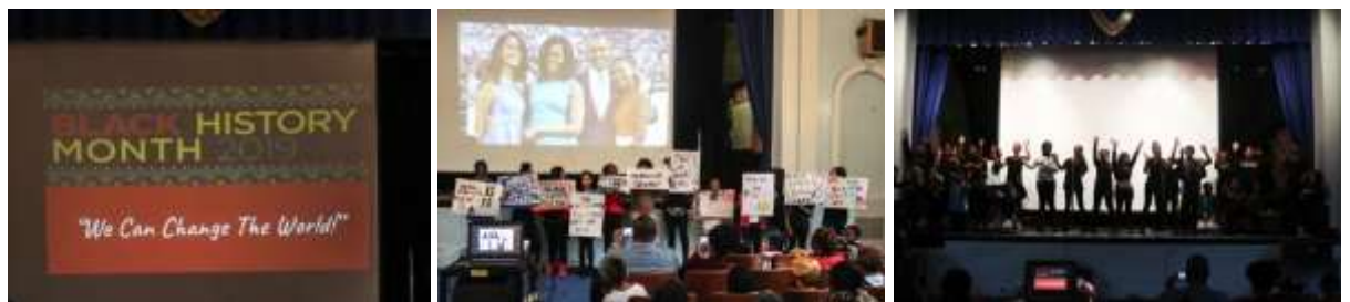
Pictured: Scenes from “We Can Change the World.”