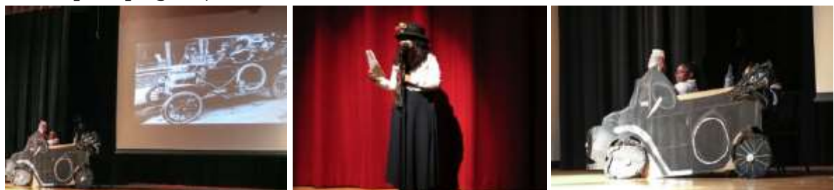
Pictured: Students recreate Madam C. J. Walker.

Lincoln Avenue School's Black History Month Celebration was an insightful event featuring students recreating iconic photos of African American historic events and individuals. Students read about each photograph, whether highlighting an individual, such as Sammy David Jr., or Madam C.J. Walker or explaining the jazz era or the NAACP, each was recreated on stage for an audience of family and friends. (Note: Images and comments only represent a segment of the complete program).