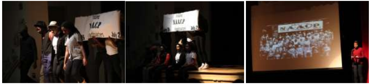
Pictured: Students recreate NAACP Headquarters photo from 1926.