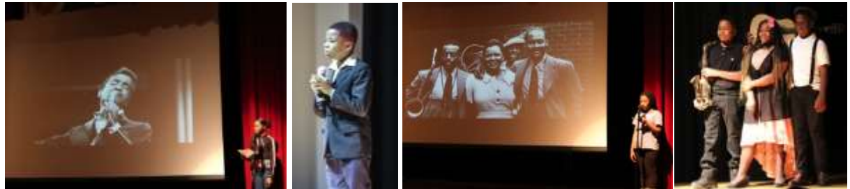
Pictured: Students recreate Sammy Davis Jr. and jazz band.