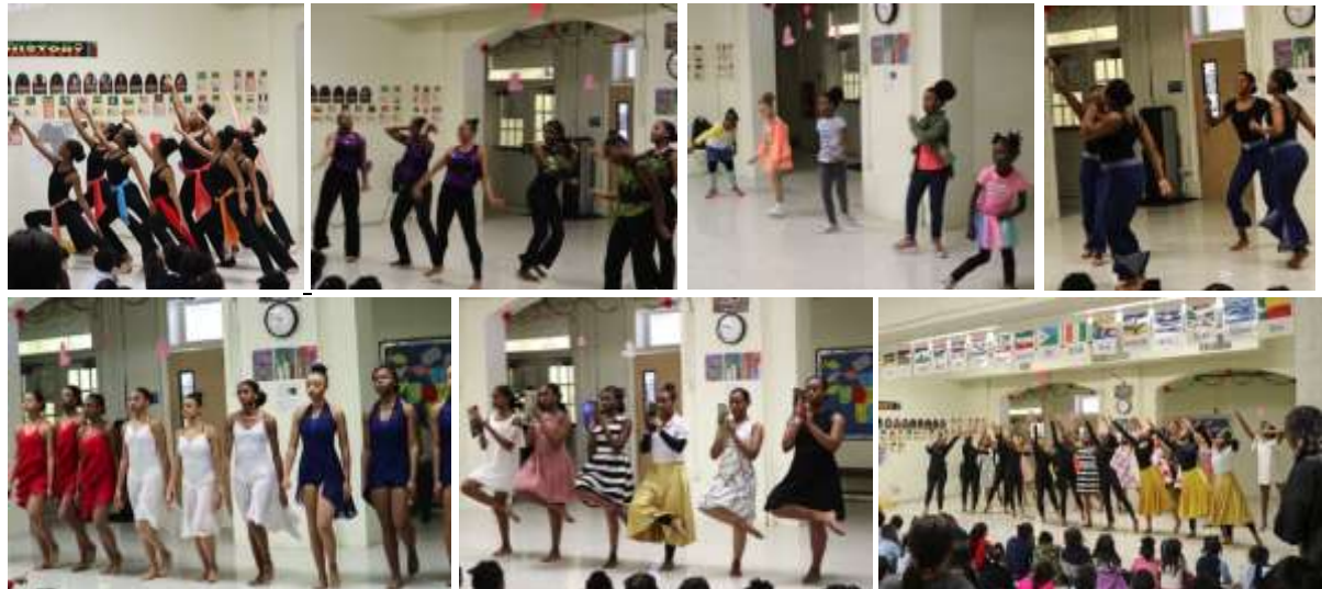
Pictured (above and left): The Premier Dance Theatre's presentation of "Trailblazers."