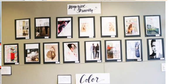
Pictured: Scenes from Orange Prep Academy's art show.