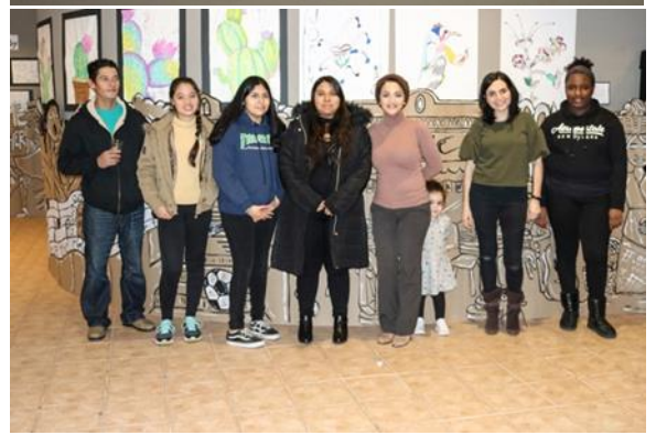
Pictured (above and left): Scenes from Orange Prep Academy's art show.