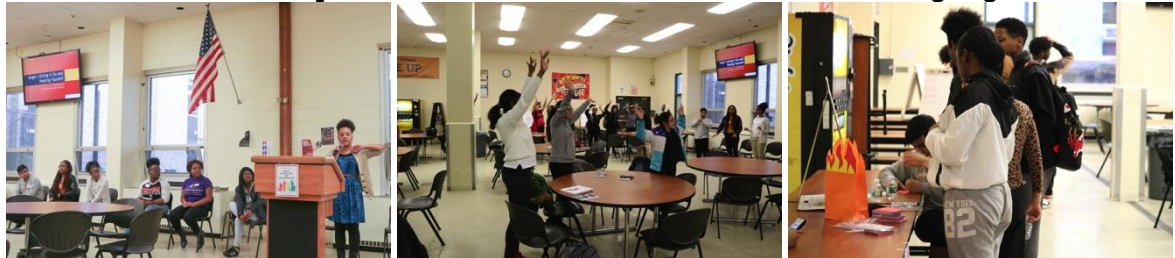
Pictured: Scenes from the Teen Forum on February 7.

A second Teen Forum is scheduled for Tuesday, March 12. The forum will be held in collaboration with The Space and The Zone. The theme will be "Surviving High School."