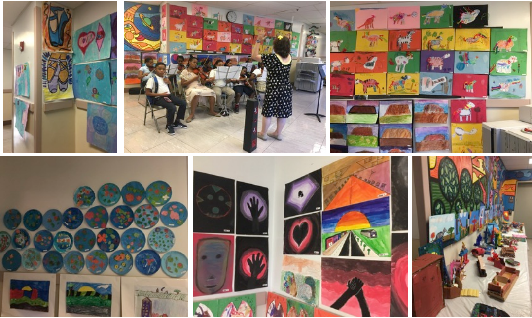
Pictured: Scenes from Heywood Avenue School's Art Show.

Each grade level made specific contributions to the show. The Kindergarteners read the African folk legend, "How The Zebra Got His Stripes" and presented their own zebra collage. They also displayed wax resist terrariums. Grade 1 learned about the aboriginal people of Australia and made their own Aboriginal hand prints mixed media collage with tempera paint. Grade 2 made aboriginal x-ray paintings and painted toy kangaroos. They also made large water color balloons based on the book "Where Do Balloons Go". Grade 3 demonstrated horizon, near, far, foreground, mid-ground and background through landscape using mixed media. Grade 5 elective picked two pieces to display, from their portfolio that included chalk pastel African Masks and Uluru rock wax resist. Grade 6 displayed acrylic paintings and sumi ink paintings.