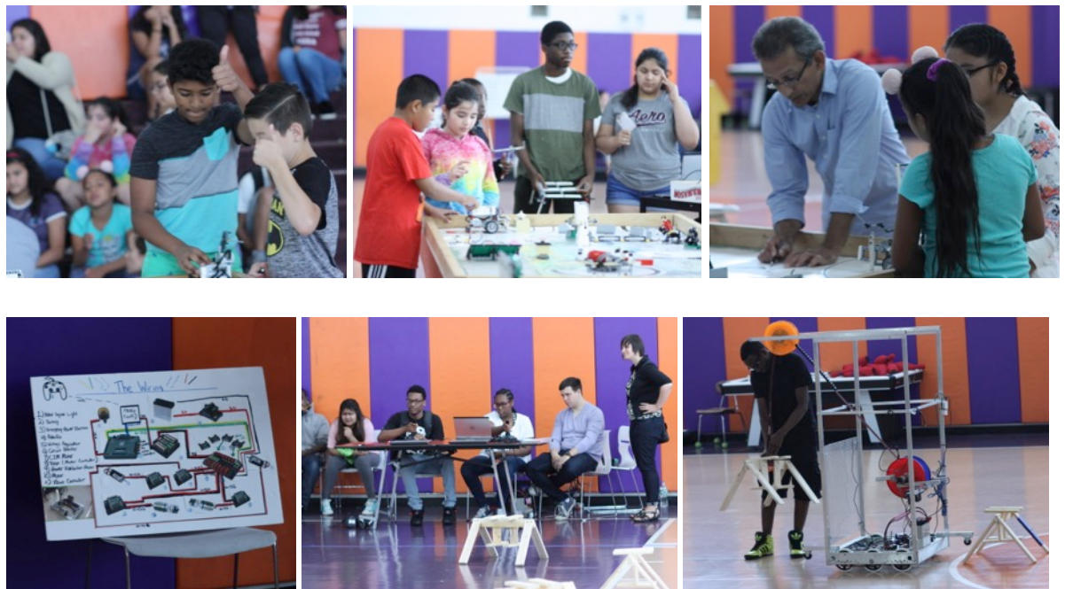
Pictured (above): Summer Robotics Camp tournament on July 27.

FIRST LEGO introduces students to real-world engineering challenges by building LEGO-based robots to complete tasks on a thematic playing surface. The First Lego Robotics Summer Program gave students the opportunity to (1) design, build, test and program robots using LEGO EV3® technology, (2) apply real-world math and science concepts, (3) research challenges facing today's scientists, (4) learn critical thinking, team-building and presentation skills, and (5) participate in a tournament.