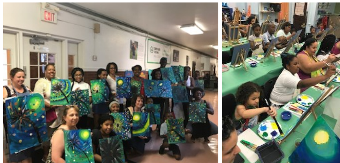
Pictured (above and right): Scenes from Heywood Avenue School's "Paint and Sip" event.