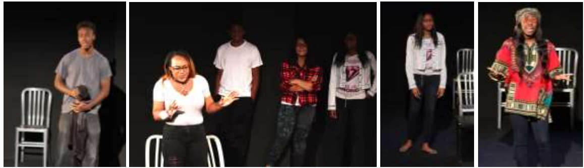
Pictured: OHS and Orange Prep students perform at the 2017 Drama Showcase.