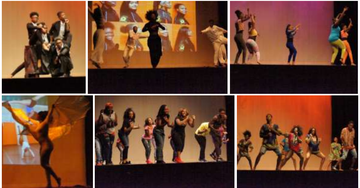
Pictured: Scenes from Dance Creations at Orange Preparation Academy