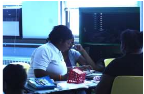
Pictured: STEM Academy of the Oranges students prepare for the new school year at the Summer Gateway Camp.

Contact Information: Orange Board of Education 451 Lincoln Avenue Orange, NJ 07050 Send Us An Email