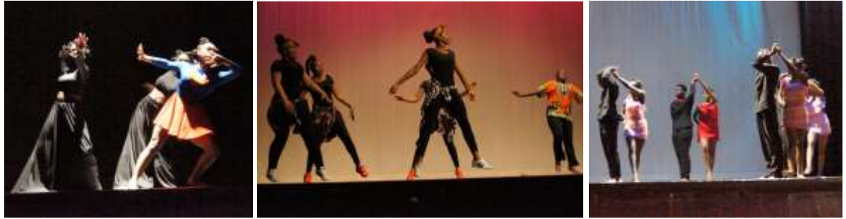
Pictured: Scenes from Dance Creations at Orange Preparation Academy