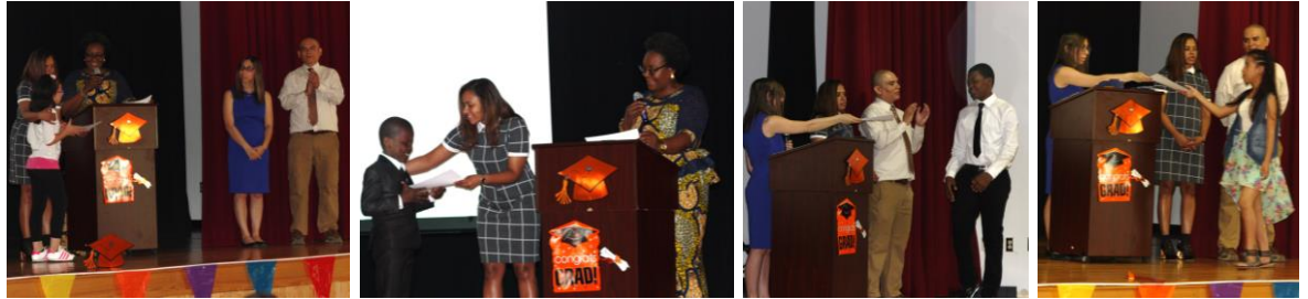
Pictured (left to right): Students receive certificate of completion.