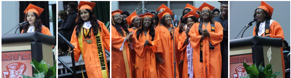
Pictured (left to right): Valedictorian; Voices in Harmony; Senior Class President.