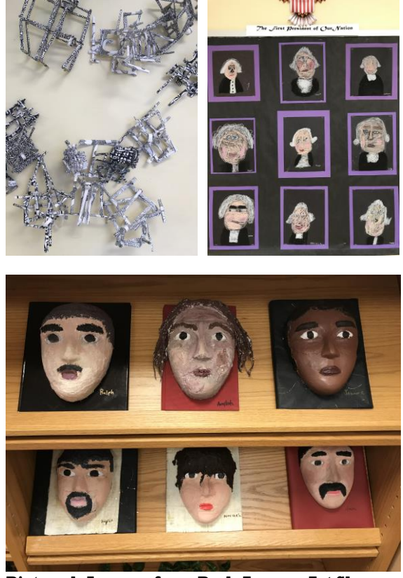
Pictured: Images from Park Avenue Art Show.