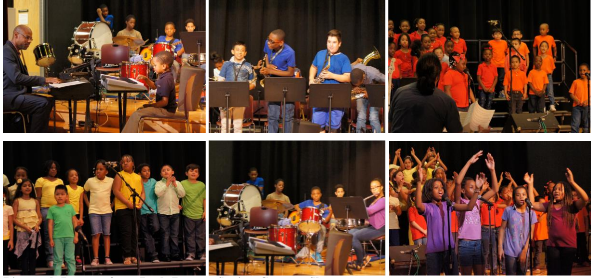
Pictured: Images from Park Avenue Spring Concert Show