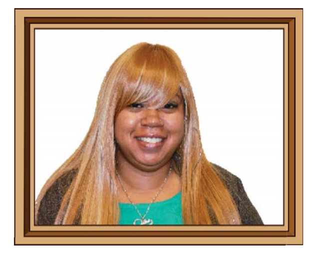
Nickeshia Gladuin Orange Early Childhood Center