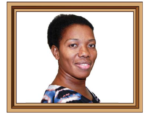
Hermencia D'Haiti Ulysse Cleveland Street School