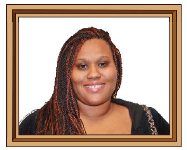
Dana Moore Scholars Academy