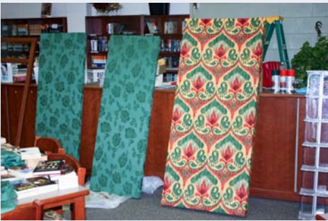
Pictured: Club members in the library; The newly painted conference room; The wall hangings.