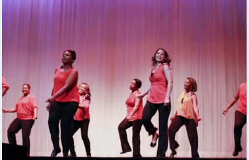
Pictured: The staff dance ensemble performs at the Orange Academy Awards.