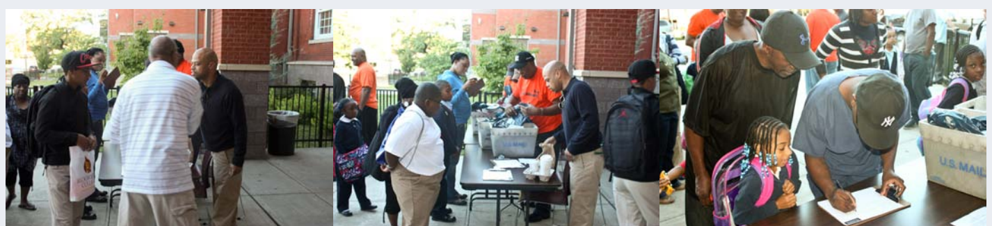
Pictured: Fathers arrive at Park Avenue School with their children for the first day of school.