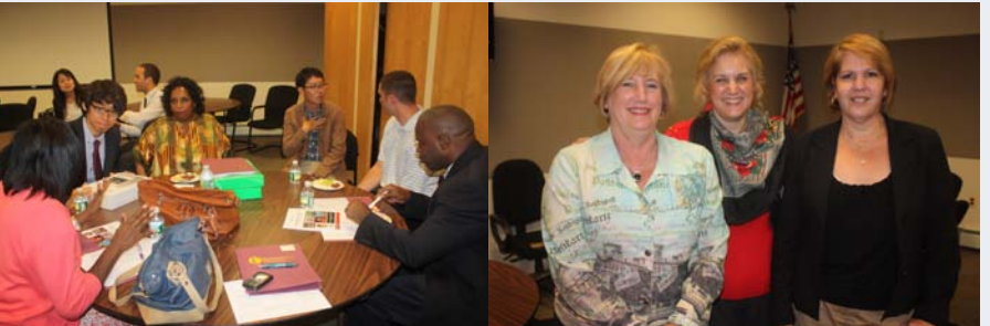
Pictured: Visiting teachers, principals, host teachers and Bloomfield College representatives; Teachers and principals meet; Bloomfield College representatives.