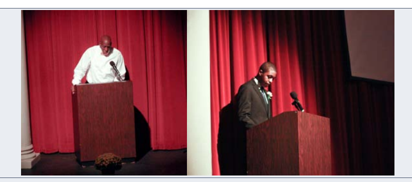
Scenes From the First Day of School