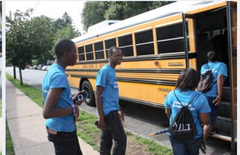
RWC students wait for the Orange Public School bus for their morning ride to NJIT