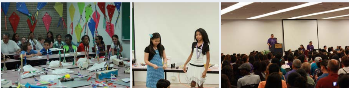
Pictured: Scenes from "See What We Did This Summer At NJIT . . ." - 2012 Early College Preparatory Programs @ NJIT event including classroom display (left) student presentation (center) and the closing ceremony in the Campus Center Ballroom (right).