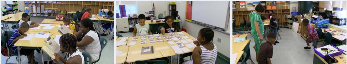
Pictured: At Park Avenue School, students were not only readying themselves for the upcoming school year with reading and writing assignments (pictured left), they were preparing themselves for the Math Carnival (center and right) culminating event.

In the elementary schools, students demonstrated mastery of new skills through Math Carnivals held at each site where students gave presentations on math activities and manned booths testing their mental math skills. In Language Arts, the students completed research and read informational texts in line with the new Common Core standards. The research and readings were used to write arguments that gave textual evidence to support claims and counterclaims. Students in grades 1 and 2 wrote opinions about particular authors' writing styles, and those in grades 3-7 researched and wrote argument essays about controversial issues. On the last day of the Summer Academy, the elementary schools sent their top teams to a culminating debate held at the OPA auditorium. Thirty-four students won medals for the strength of their arguments.