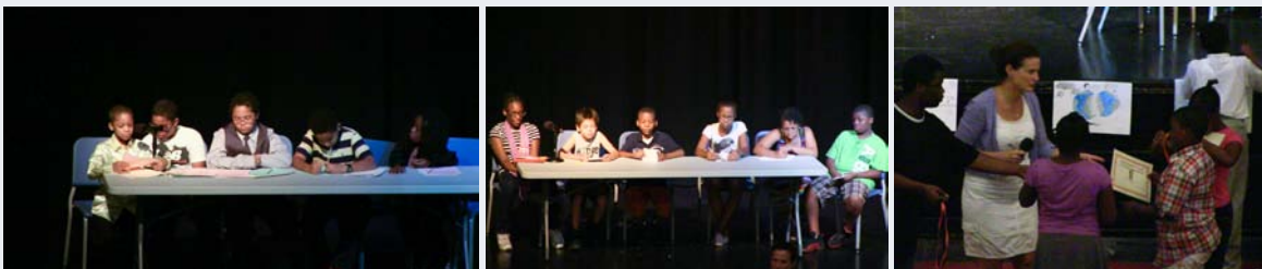
Pictured: Scenes from the summer Academy debate held at OPA Auditorium on August 2.

At Rosa Parks Central Community School (RPCCS), the last day of their academy concluded with a Summer Program