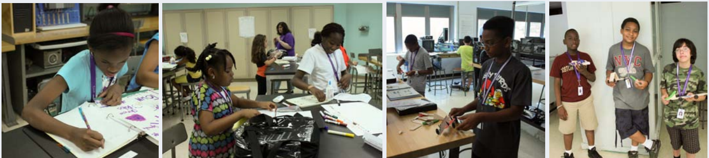
Pictured: Students are show during class sessions on July 24th at NJIT completing environmental science projects (photo 1 and 2) and completing/displaying self-propelled model cars (photo 2 and 3).