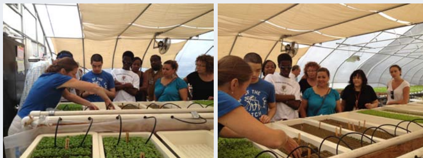
Orange students visit the Garden State Urban Farms on July 26, 2012.