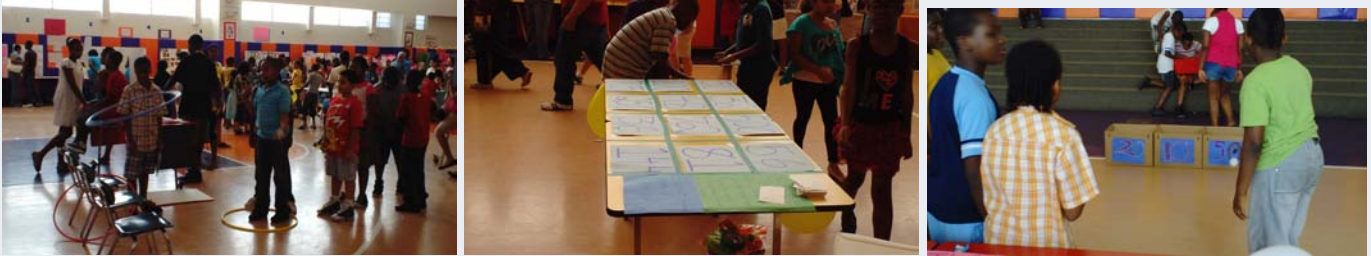
Pictured: RPCCS students are show enjoying the school's carnival on the final day of their summer program.

Carnival. The day opened with an Awards Ceremony acknowledging students who received awards for attendance, most improved, best overall and most conscientious. There was a "wall walk" to showcase work completed by the students in English Language Arts and Mathematics. All the students and over 30 parents who were in attendance had an "absolute blast" playing the various games at booths set up and managed by the students.