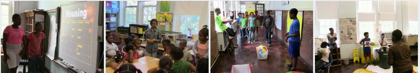
Pictured: At Heywood Avenue School, students made math presentations on "How Would You Spend a Million Dollars" (left) and visited various math stations, participating in fun math challenges designed and run by the students (center and right).