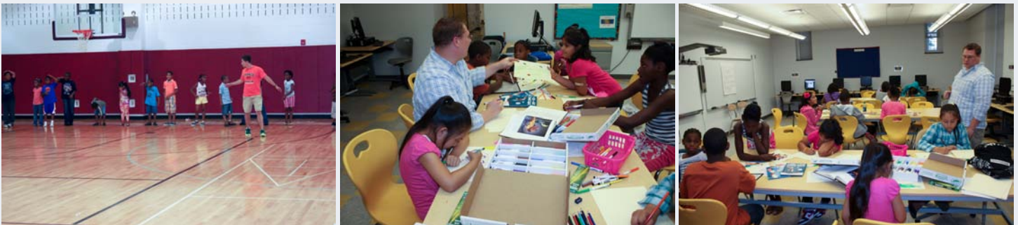
Pictured: Lincoln Avenue students are show enjoying an afternoon in the gym and in art class.