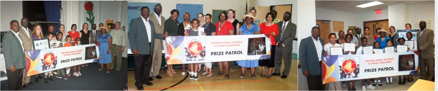
Pictured (left to right) Student winners from Heywood Avenue School, Forest Street School and Rosa Parks Central Community School.