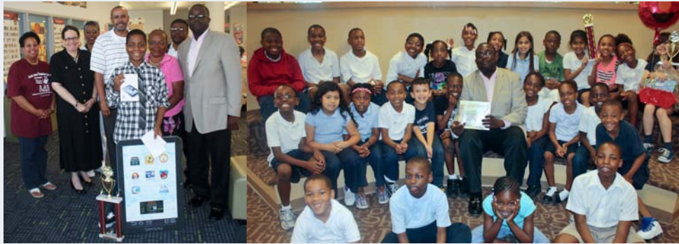
Pictured (left to right) Student winner - from Lincoln Avenue School; and Park Avenue School readers.