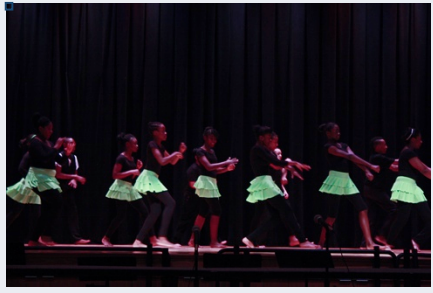
Pictured: Scenes Lincoln Avenue School's Winter Concert.