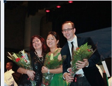
Pictured: Scenes Heywood Avenue School's Winter Concert.