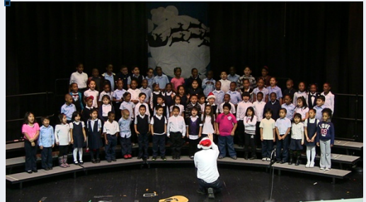
Pictured: Scenes RPCCS's (Grades K-1) Winter Concert.