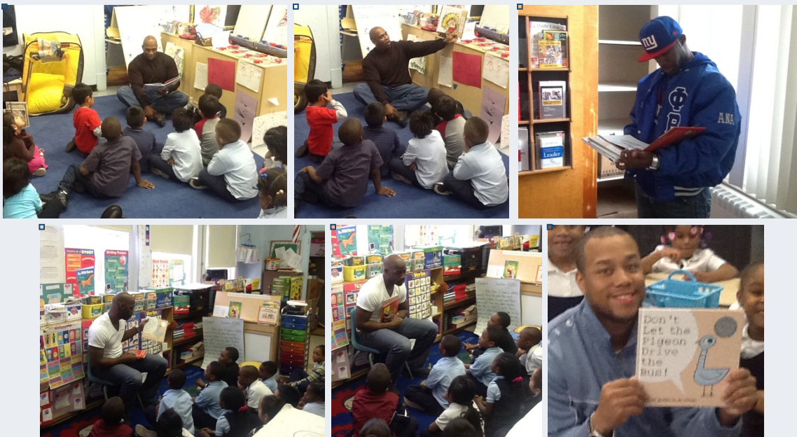
Pictured: Scenes from RPCCS Dads Read, Dads Lead Day.

All of the dads that attended were able to pick out a free book with their child to take home with them. The next Dads Lead, Dads Lead Day is December 21, 2012. Other district schools are participating in the Fathers Reading Club, as well, and interested men should contact their local schools.