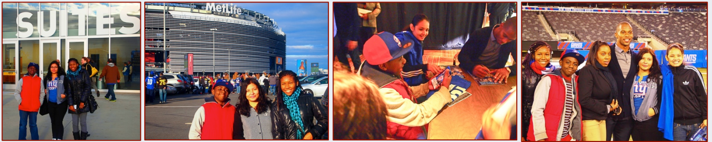
Pictured: Orange students on a "power outing" at the GIANTS game against the Pittsburgh Steelers, as special guests of Victor Cruz, the NY GIANTS and JP Morgan CHASE.