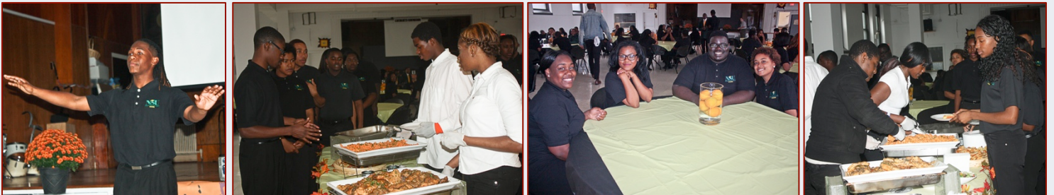
Pictured: Scenes from the luncheon at Scholars Academy catered by culinary arts students from Career Innovation Academy of Orange.