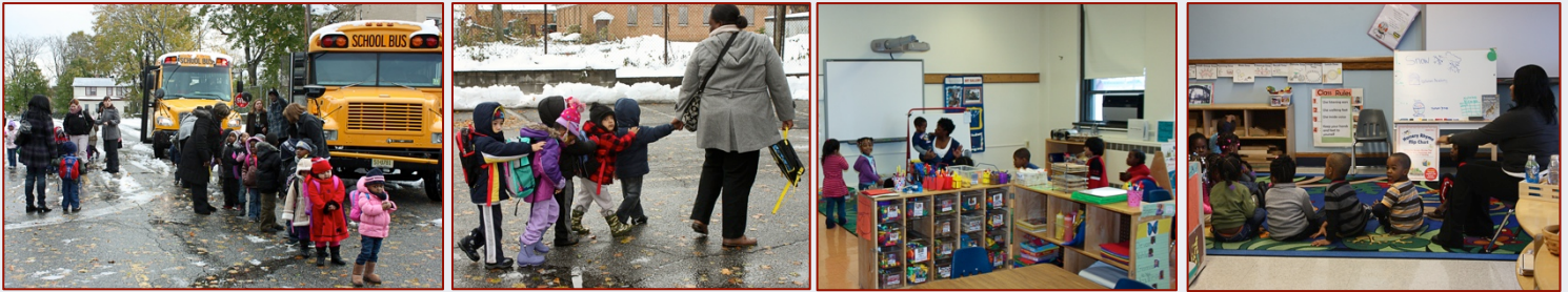
Pictured: Preschool students arrive at Scholars Academy and are escorted to the building where they settle in for the day.

Please note that Scholars Academy is also able to function fully and will resume normal operations this coming Monday, November 12, 2012.