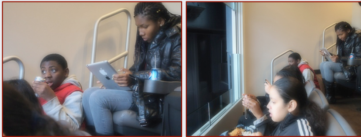
Pictured: Students enjoy the game in box seats at MetLife Stadium.