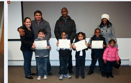
Pictured: Scenes from the Rosa Parks Central Community School's Art Opening.