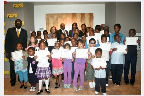
Scenes from Park Avenue's Art Show