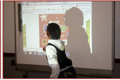
Pictured: Scenes from Rosa Parks Central Community School's Family Math Night.