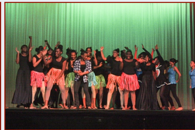
Pictured: Scenes from "Unspoken", performed by OPA Dance Ensemble.